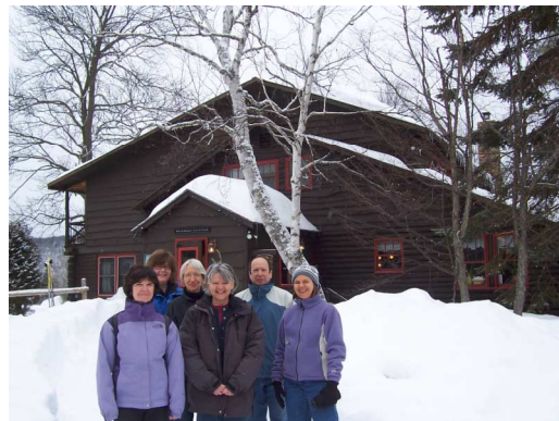
Garnet Hill Lodge, Adirondacks

On Sunday and Monday, I will lead an advanced beginner/intermediate outing for those interested. But, if you want a gentler or more aggressive outing, it’s right there for you, and I’m sure there will be others interested in your same level of exertion and difficulty. On one of those days, I will lead an off-site outing through backcountry (beautiful single-track that’s easily done by anyone beyond the purely novice level). You can read about our previous club outing to GH in the March 2007 Upslope on the