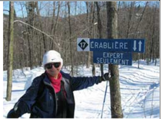
What does this say in French?

Description: This is the third excursion trip by the STS to the ski touring areas located in the Laurentians north of Montreal. About two dozen Nordic ski centers are available in this winter vacation wonderland! We will visit six of them during our week's stay. Available centers include Mont Tremblant http://www.skidefondmont-tremblant.com/eng/index.php , Parc des Campeurs http://www.parcdescampeurs.com/ete/en/index.html , and Morin Heights http://www.morinheights.com/ . We will likely include in our week's outings one or more of the ski areas we have not visited before. Snowshoeing options exist at all these centers. We will stay in a large chalet in Val-David with overflow skiers residing in a nearby vacation chalet complete with private sauna. Trip price includes 7-nights lodging, in-house food and drink, and minivan transport from Burlington, VT. Van drivers will be rebated part of the trip cost. Six full days of skiing in Quebec with the overlay of an almost-European culture! Note: Valid U.S. passport required for this trip.