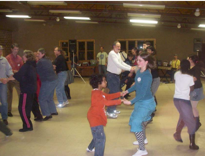
Ski Dance Weekend