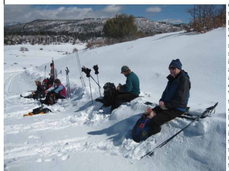
Trail Lunch

wire fences to explore further. However some people found that they sank too far into the deep, unbroken snow for comfort, so they returned to the regular trails. The others of us explored to our hearts content, marveling at how the texture and depth of the winter's snow varied from place to place. After eating a late lunch out on the trail, we eventually skied back to the Coyote Hill trails and explored the other loop options there before calling it a day. A dozen or two other skiers had skied at this location after our arrival that morning, so the trail snow was well used by the time we arrived back at our vehicles.