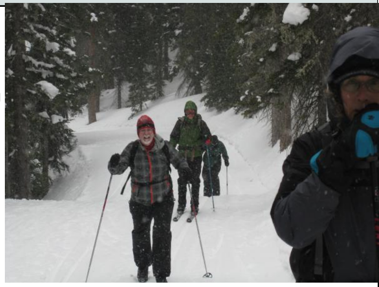
On Sunday

The next day we decided to try one of the lesser known trail systems identified in the Pagosa Springs Cross Country Ski Trails brochure. The brochure identifies 14 separate spots to ski in and around the town, including, of course, the Wolf Creek Pass area we had enjoyed the day before. This time we tried the Coyote Hill Nordic Trails. There had been ski races there the morning before, but due to the new snow, all was pristine and white when we pulled into the parking lot—the first vehicles of the day. That day was bright and sunny, so sunglasses and sun block were in order. There were some lovely views of distant Colorado peaks as we skied. After most of us made it around the main trail loop, a group of us decided to go "off the reservation" and head over some largely buried barbed