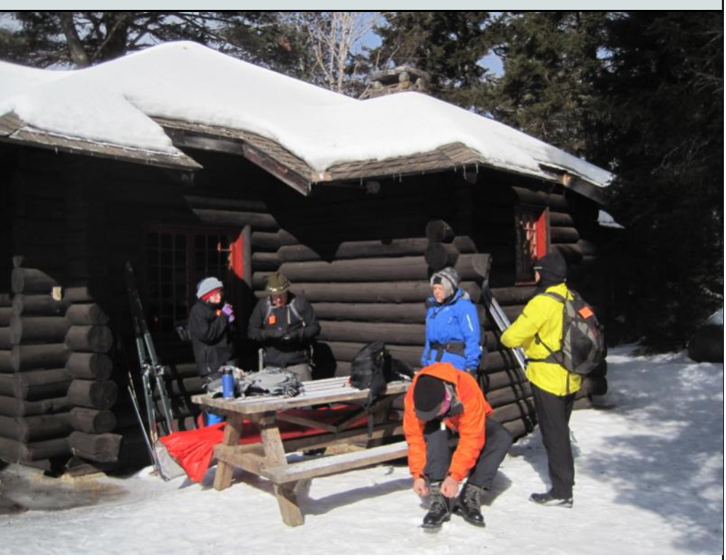
Lunch in a sunny nook at Santanoni Camp

On the way back out, we spent some time at the Farm Complex again for a bit of glade skiing. This Santanoni trail also offered access to adjacent state lands, with trails to various ponds, and multi-day loop outing possibilities. We chose the semi-weenie option of making it an in-and-out day outing, with a fireplace, dinner, and a warm bed back at Garnet Hill Lodge.