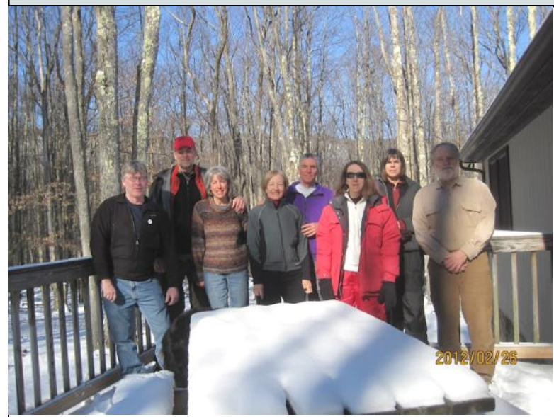
Eight Skiers at Canaan