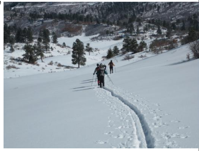
Colorado downhill skiing

Our time on skis or snowshoes had increased each day of the trip, beginning at about 4 hours of skiing at first and ending at 7.5 hours on the skis by Friday. For much of the group this was their only skiing opportunity this winter, so it took them some time to get their "ski legs" fully back.