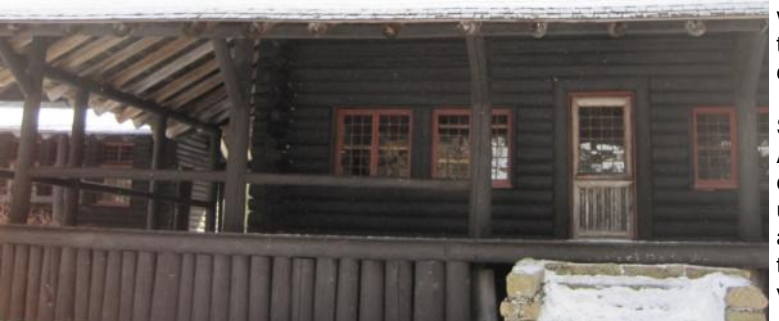
Main building at Santanoni Camp

winter, one of the best places in the North Country to ski has been the trail to Santanoni Great Camp in the Essex County town of Newcomb. " Skiing past the Farm Complex, we caught occasional glimpses of the