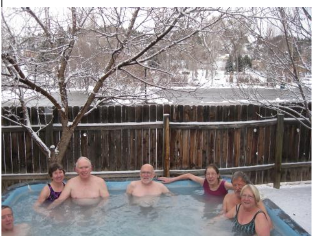
Pagosa Hot Springs

Pagosa Springs had a surprisingly broad range of restaurants to enjoy our week there, but several of them were totally booked when we tried to visit them. One of these was the town microbrewery which was a nondescript place with a dirt parking lot off a side street. But its beer was great and we couldn't even get a place in the parking lot by the end of the week.