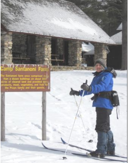
Santanoni Farm

nership among Adirondack Architectural Heritage, the town of Newcomb, the College of environmental Science and Forestry, and others have ensured that the camp wouldn't simply fall into ruin. Among other