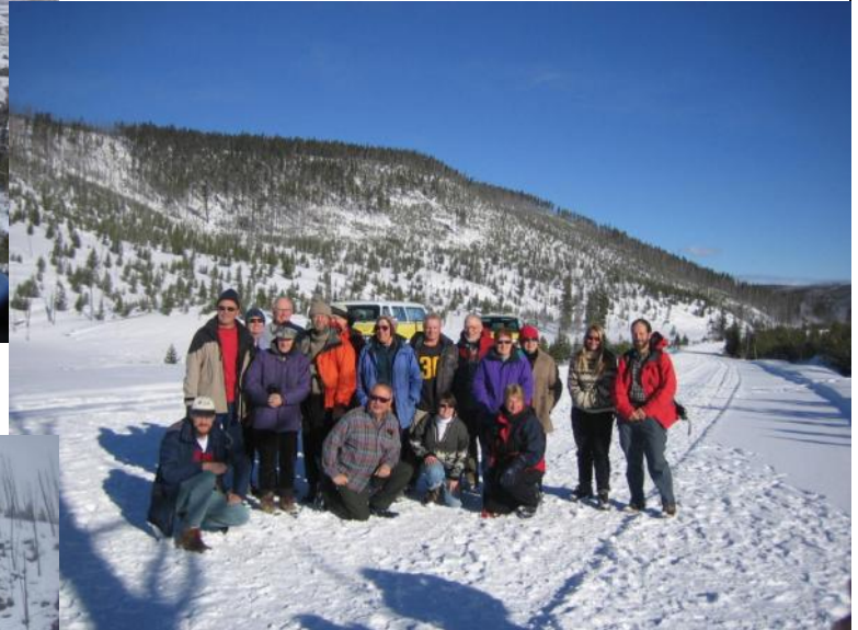
Overview from the edge of Sheepeater Canyon down to the Mammoth Hot Springs hotel complex