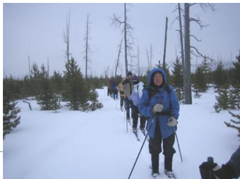
Skiers at Yellowstone NP

PATC-Ski Touring Section c/o Doug Lesar 2507 Campbell Place