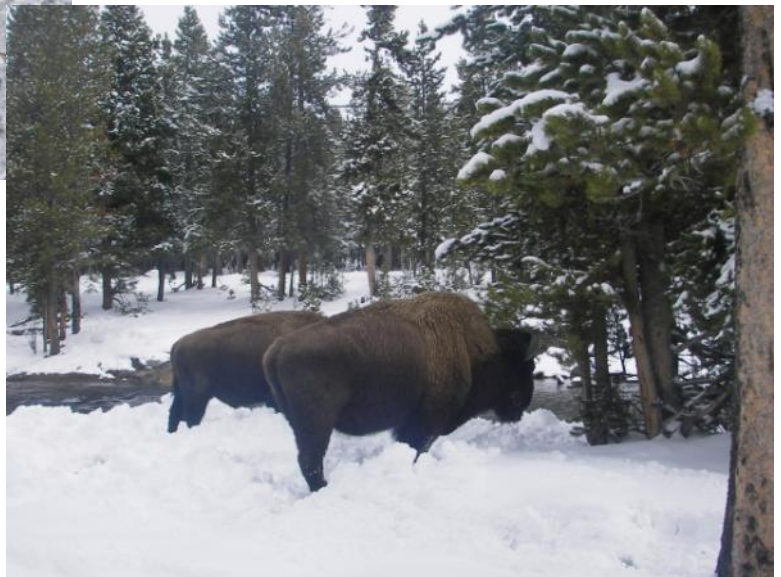
Healthier bison on the Firehole River