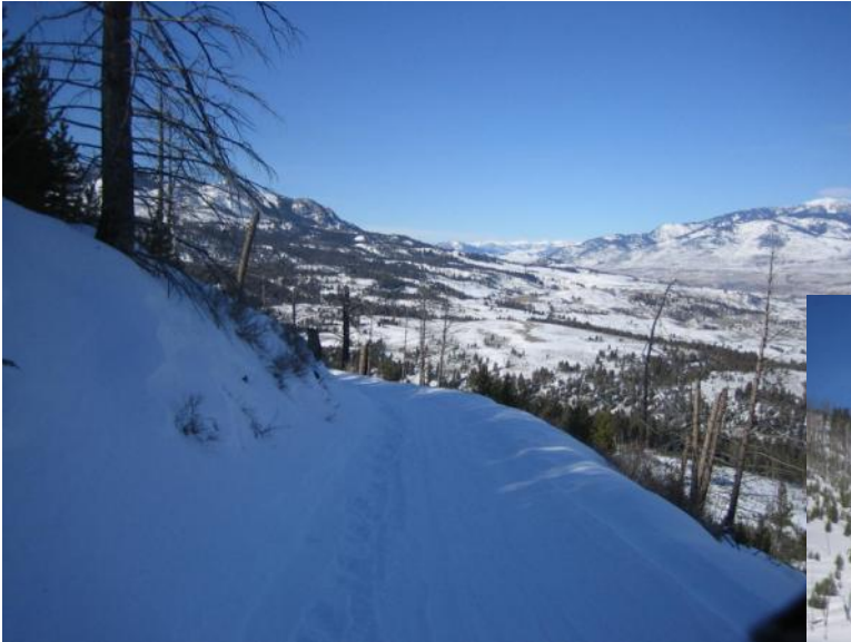
Overview from the edge of Sheepeater Canyon down to the Mammoth Hot Springs hotel complex