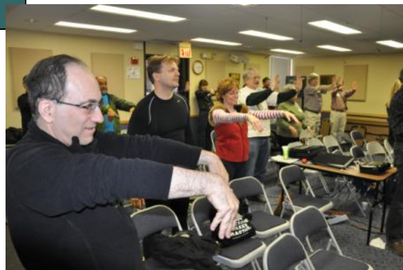
Lectures, and more

By Car: Once you find the intersection of Interstate 66 and Interstate 495 (alias the Washington Beltway), take the Nutley Street North (VA Rt. 243) exit just outside the Beltway. Go north just over 1 mile pass-ing two traffic lights. When you get to the third light, turn right onto Route 123 (alias Maple Avenue). Continue in the right-hand lane for about ¾ mile or count traffic lights. When you reach the fourth light, turn right onto Park