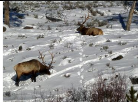
Bull Elk resting in snow