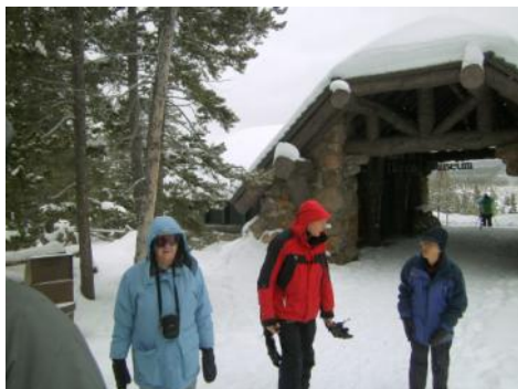
Norris Geyser Basin