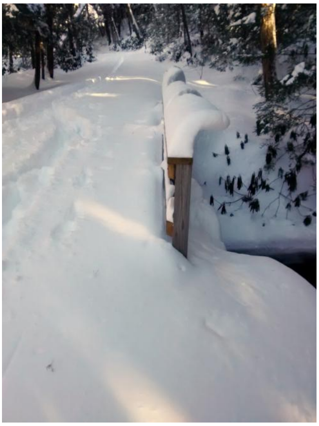
Snow slumping a little on a groomed trail