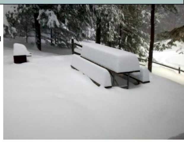
Lots of snow last year in New Germany