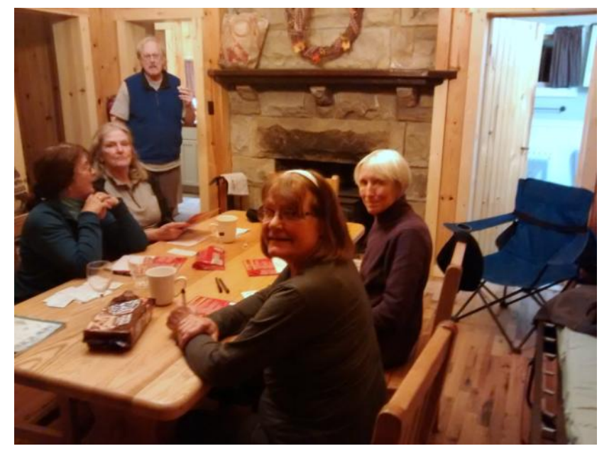
PATC-STS skiers at New Germany 2016

Hopefully, we will have plenty of snow again (see forecast p. 3), but if not, there is plenty of good hiking in the park and the vicinity. This trip has no cancellation.