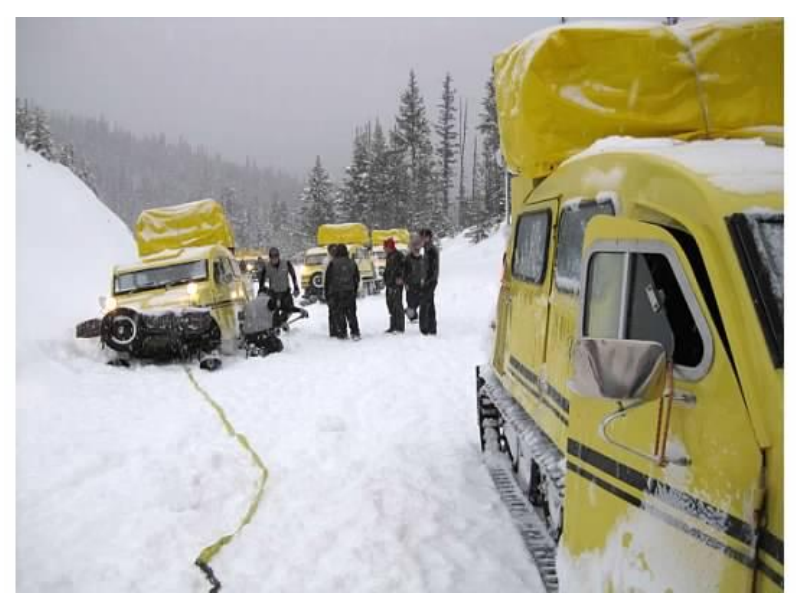
Yellowstone Park support personnel planning the recovery of our stranded bombardier

The new bombardiers can take up to 10 passengers each, plus their luggage, which is stowed under a heavy tarp on top of the vehicle. The 40-mile trip takes about 3 hours. Several stops are made along the way to permit passengers to see and experience special aspects of the park. Driving a ski-and-tracked vehicle on these snow-covered roads is tricky, and our vehicle skidded off the roadway due to loose snow about 10 miles short of Old Faithful. Fortunately the bombardier vehicles travel in loose convoys, with each being about 10 minutes apart. Our situation was radioed to the bombardiers behind us, and soon a cluster of half a dozen yellow bombardiers was gathered around us. Ultimately three of the tracked vehicles using tow straps were able to pull our yellow bom-