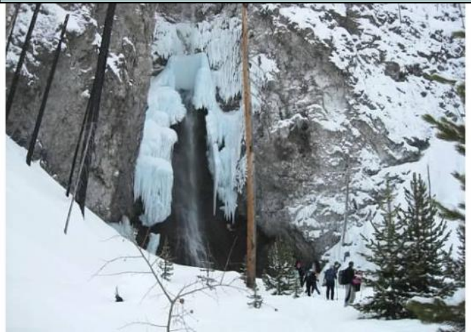
Skiers enjoying the magical grandeur of Fairy Falls