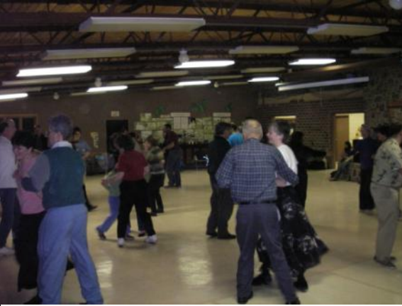
Skiers dancing