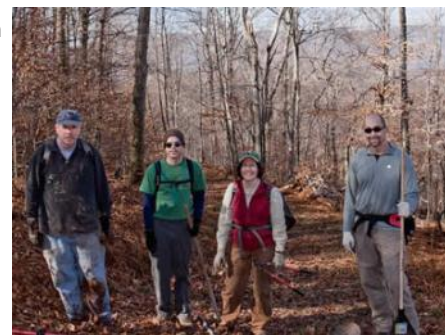
2009 Work Trip