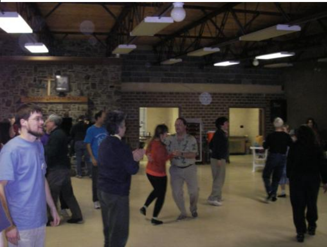
More dancers

the prompts. Both the English and the Contra dancing are