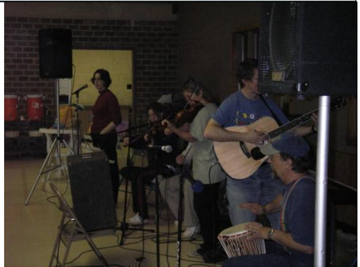
The band