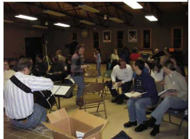
Tuning up for the Sing-Along

After the sing-along we have always have a dance and a caller/teacher. We encourage people who have two "left feet" to get out on the dance floor and to follow