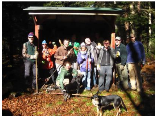
White Grass Work Trip, 2013