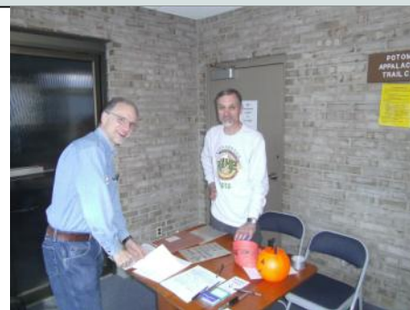
Renew your PATC-STS Membership

By Bike: Yes, many of our members enjoy other forms of self-propelled transportation, and reaching PATC headquarters couldn't be easier. Take the Washington & Old Dominion Trail to Vienna. Where the trail crosses Park Street, turn north and ride roughly a block and a half until you see the headquarters on your right at 118 Park Street. Lock up, and come on inside; helmet hair and Lycra are welcome!