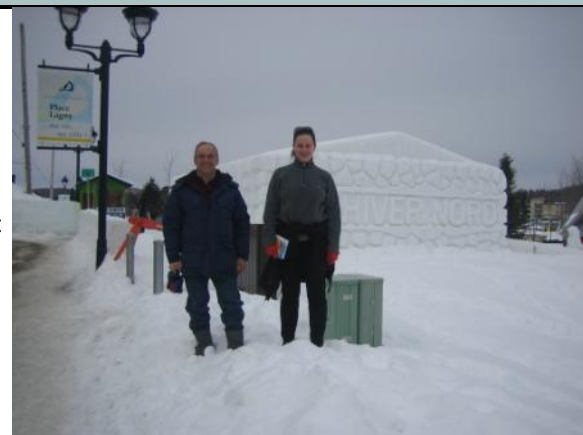
HIVER NORD snow sculpture in a Laurentians town, 2005

The STS ski group will be renting chalets in the Laurentians, most likely in the Chantclair Resort in the town of Val-David. See https://chalets.ca/ On previous trips we have rented chalets here and been very pleased with the accommodations. Those who know me will not be surprised to learn that each chalet has its own sauna. Depending on the size of the ski group, we will likely rotate among the residences we rent in terms of where evening meals will take place and where we will fix our daily lunches to take onto the trails. Bon appétit!