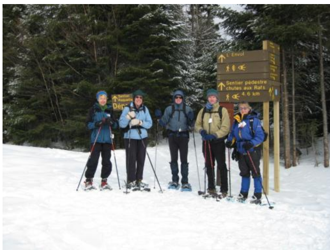
Snowshoeing at Mont Tremblant, 2011