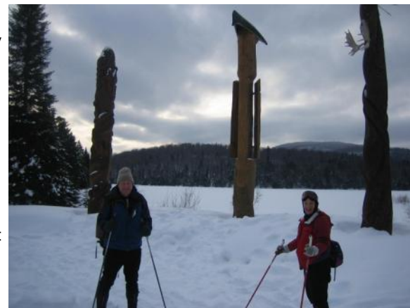
Totem poles at Mount Tremblant ski touring center, 2008