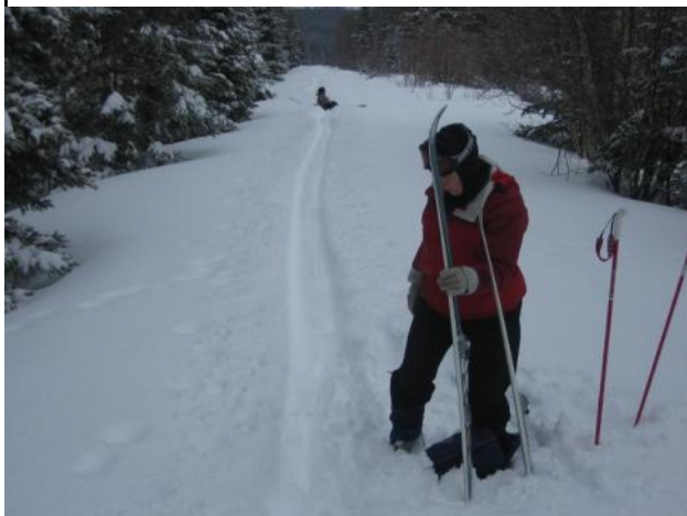
Deep snow on Le Petit Train du Nord rail trail, 2008

And, at the end of every day of winter sports in Quebec, there is always the après-ski socializing. Oh la la! It's not by chance that après-ski is a French expression. The grocery stores in Quebec are filled with a wide array of cheeses, breads, and other delicacies that really make it feel that you are in Europe.