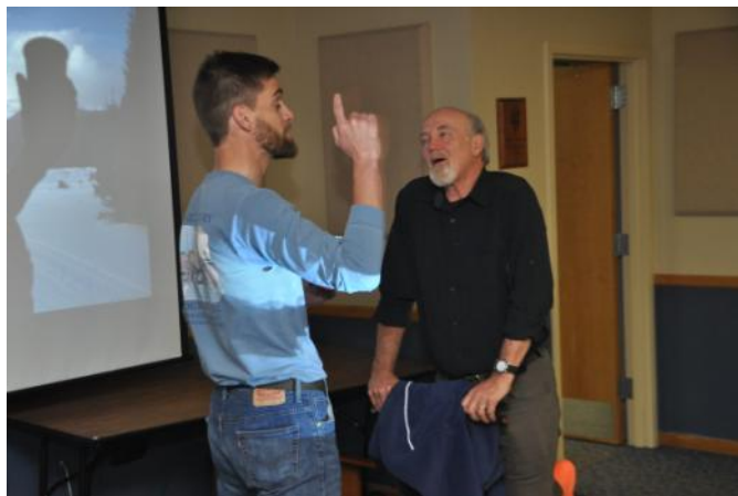
Learn about skiing

By Car: Once you find the intersection of Interstate 66 and Interstate 495 (alias the Washington Beltway), take the Nutley Street North (VA Rt. 243) exit just outside the Beltway. Go north just over 1 mile passing two traffic lights. When you get to the third light, turn right onto Route 123 (alias Maple