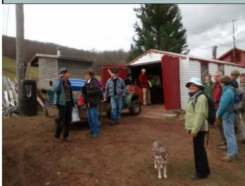
The old tool shed

A work trip has been scheduled to improve trails prior to the ski season. YOUR help is needed to make things better for EVERYONE.