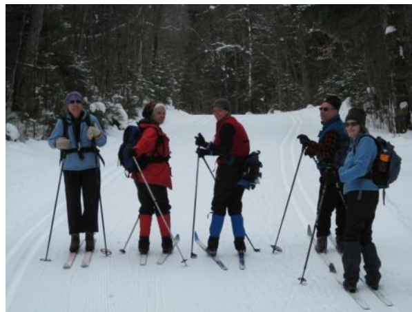
On the Laurentian ski trails, 2011