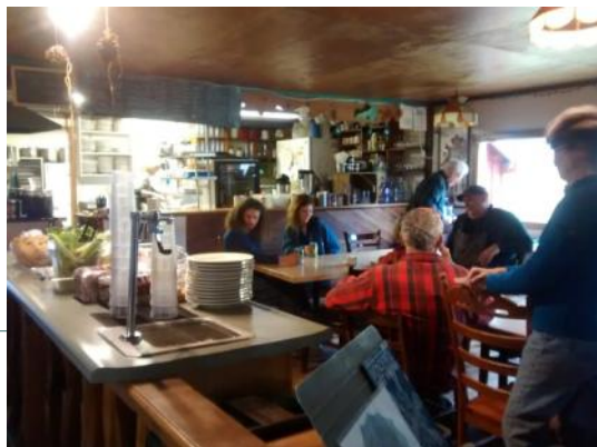
White Grass Work Trip, 2017