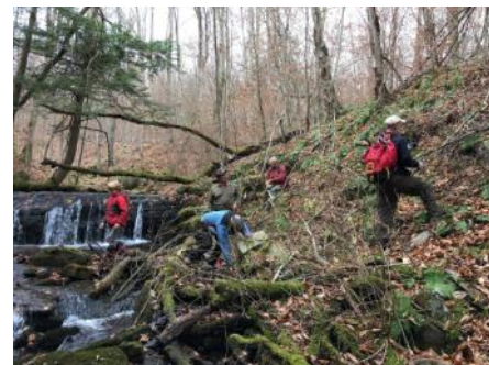
2017 Work Trip