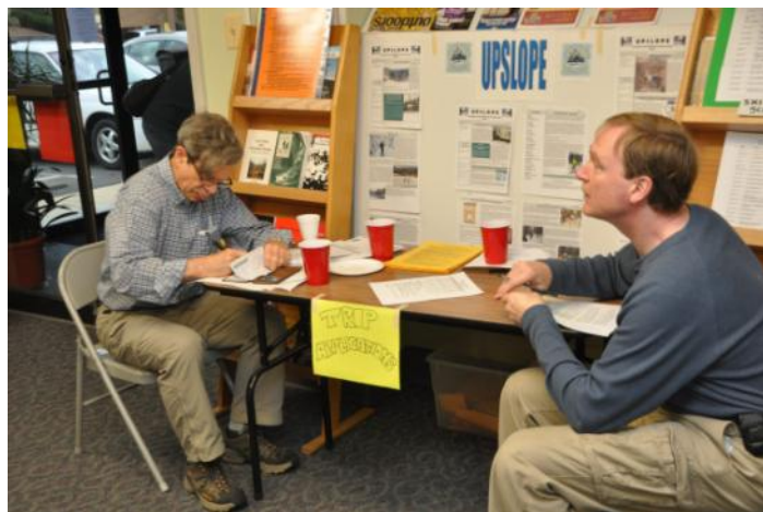
Sign up for trips

Join the Potomac Appalachian Trail Club's Ski Touring Section as we kick off the coming season with our annual Ski Fair. Whether you're looking for basic information about cross country skiing or gear, want to know more about local destinations, or are interested in joining one of our regional or out-of-area trips, you'll find it on Saturday, November 3, 12:30-4:30 at the PATC offices, 118 Park Street in Vienna, VA (directions below).