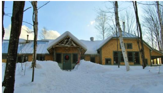
Flagstaff Pond Hut