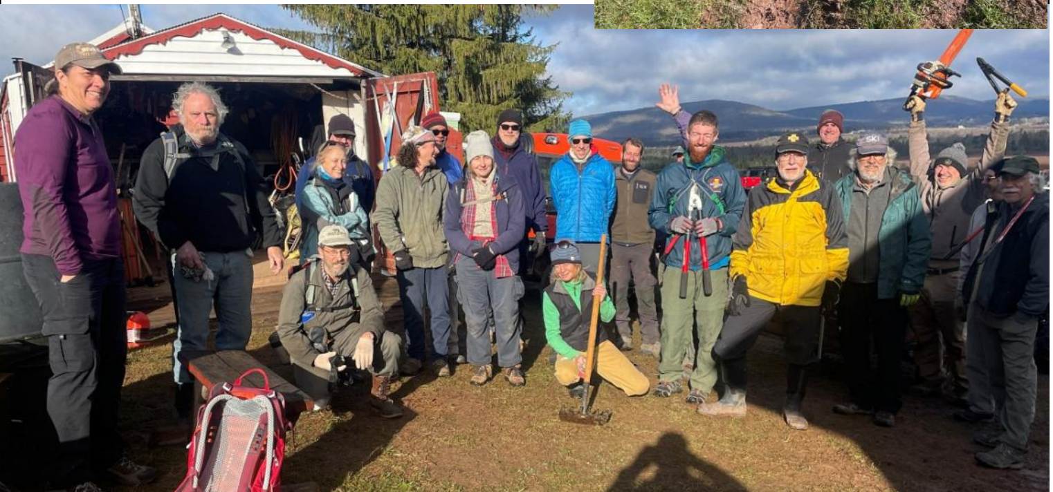
White Grass workers assemble for a day of trail maintenance