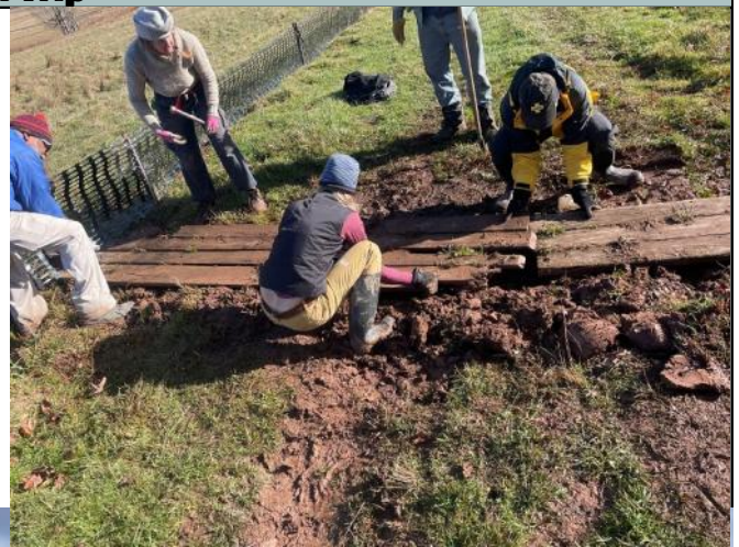
right PATC-STS workers attack a bridge