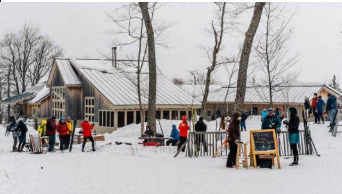
Stratton Brook Hut

The Maine Hut Trails offer a unique and beautiful location to enjoy skiing, snowshoeing, and fat biking. With over 25 miles of groomed trails, and many more ungroomed backcountry trails to explore, the area is perfect for both beginners and experienced adventurers. Whether you're looking for a peaceful and serene experience or an adrenaline-packed adventure, the Maine Hut Trails in Northwestern Maine are an excellent choice for anyone looking to make the most of the winter season.