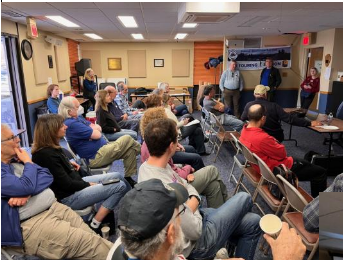
A big crowd at the Ski Fair