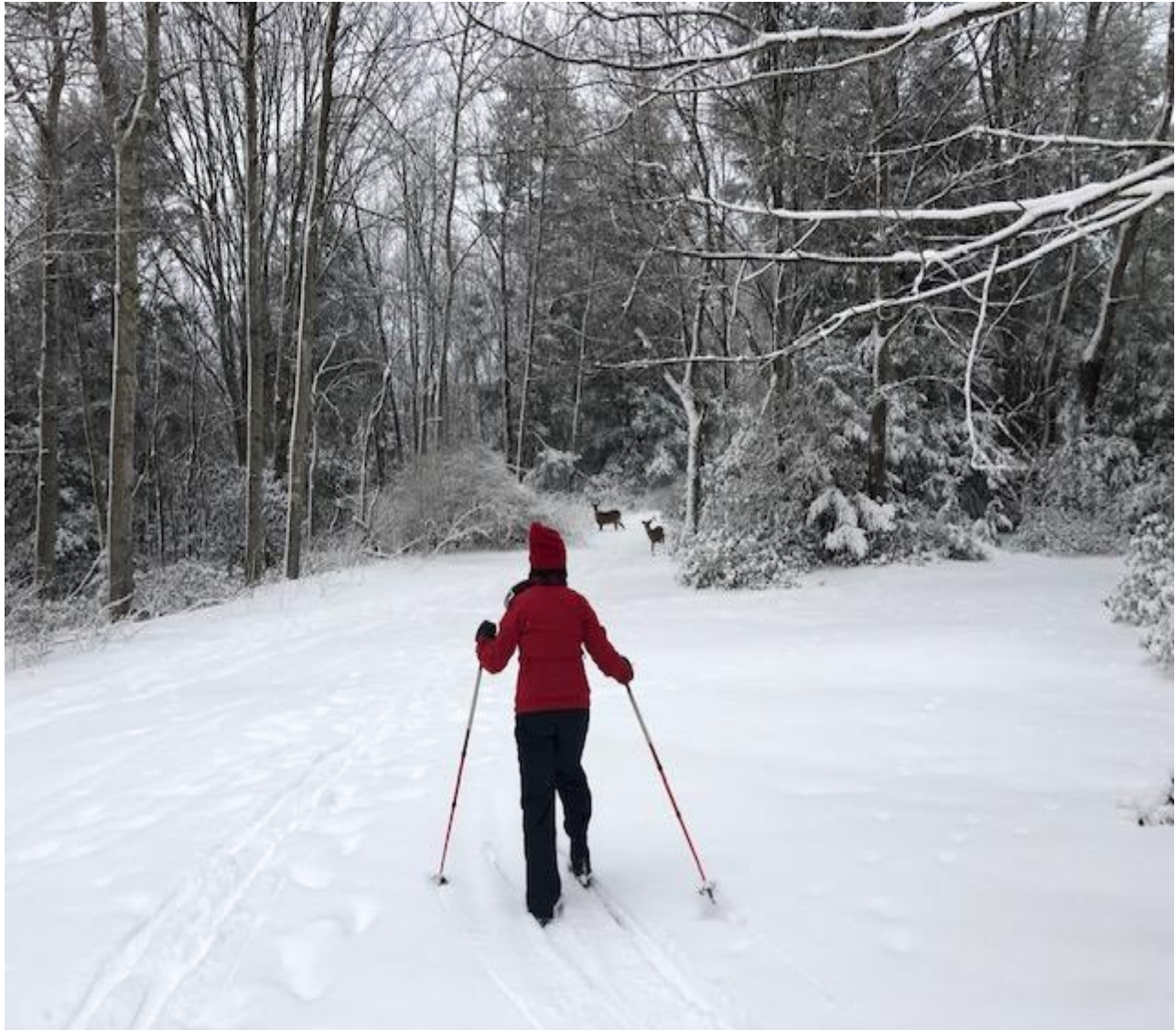
Skiing with wildlife at Blackwater Falls, WV

Cost— $550 including rental house and at-house meals.