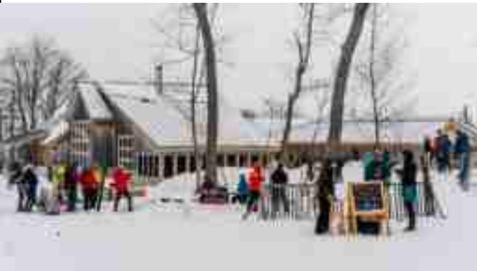
Stratton Brook Hut

The Maine Hut Trails offer a unique and beautiful location to enjoy skiing, snowshoeing, and fat biking. With over 25 miles of groomed trails, and many more ungroomed backcountry trails to explore, the area is perfect for both beginners and experienced adventurers. Whether you're looking for a peaceful and serene experience or an adrenaline-packed adventure, the Maine Hut Trails in Northwestern Maine are an excellent choice for anyone looking to make the most of the winter season.