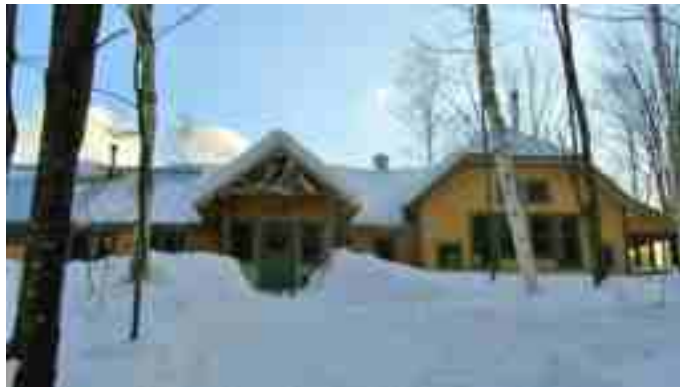
Flagstaff Pond Hut