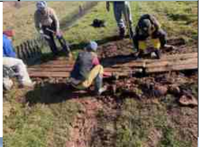
right PATC-STS workers attack a bridge