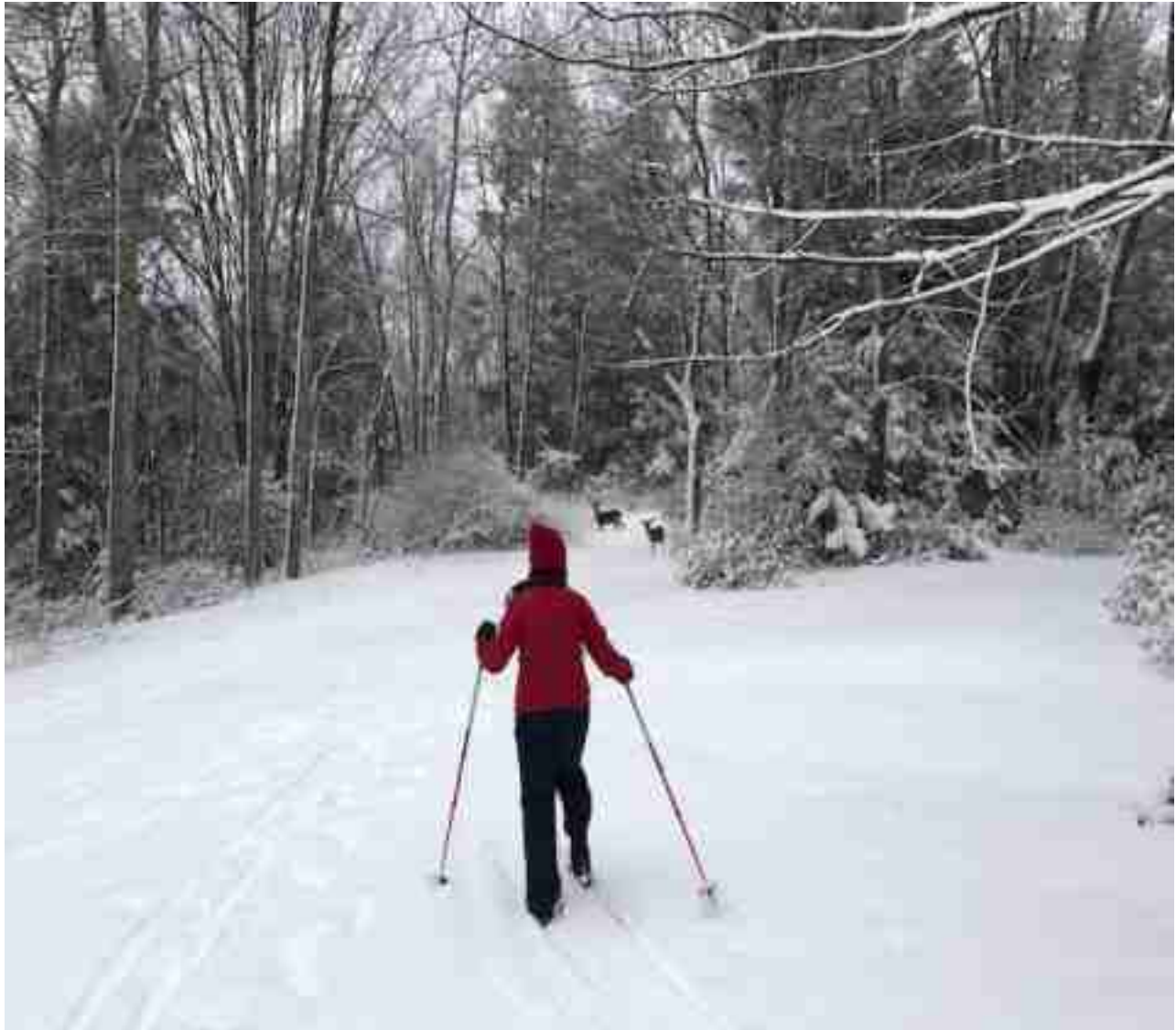
Skiing with wildlife at Blackwater Falls, WV

Cost— $550 including rental house and at-house meals.