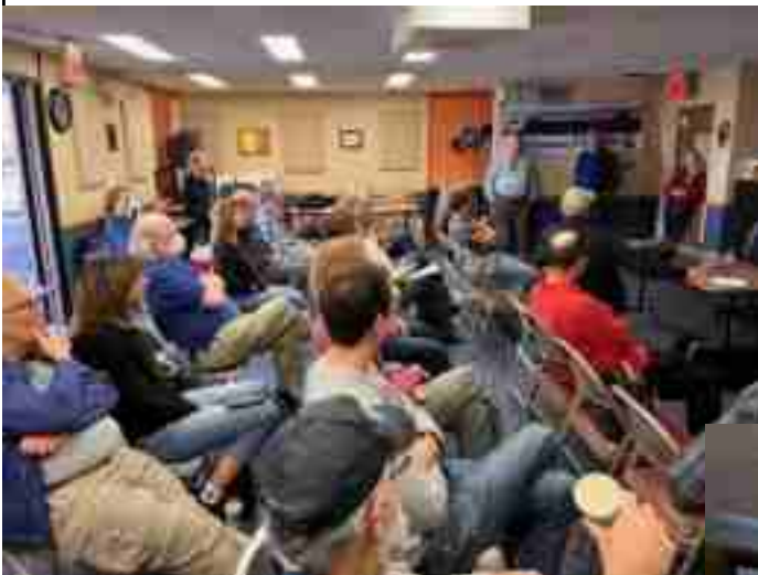
A big crowd at the Ski Fair