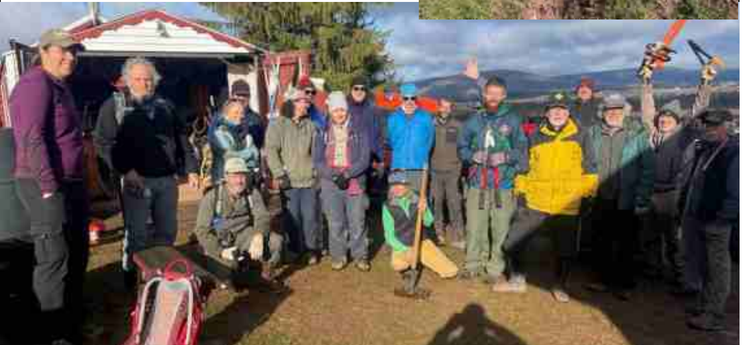
White Grass workers assemble for a day of trail maintenance