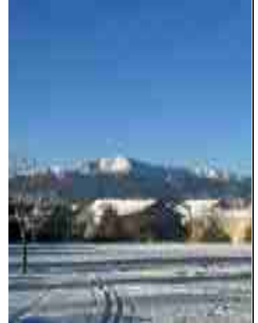
Eugene McCleary Park, Colorado Springs, CO, with Pikes Peak in the background

It is the start of a great cross country ski year! Strong El Niño, weakening polar vortex, “upslope snow” in Canaan Valley, WV, and the Laurel Highlands of Pennsylvania covered in lots of fluffy stuff—plenty of snow to go around! Now, the snow is not without a few ups and down such as rain, crazy wind, and the usual mid-Atlantic temperature swings but there are some great opportunities for “kicking and gliding” in both the mountains, the Highlands, and even out the backdoor with the latest storm passage. Lots of STSers have been getting out on their skis and exploring.