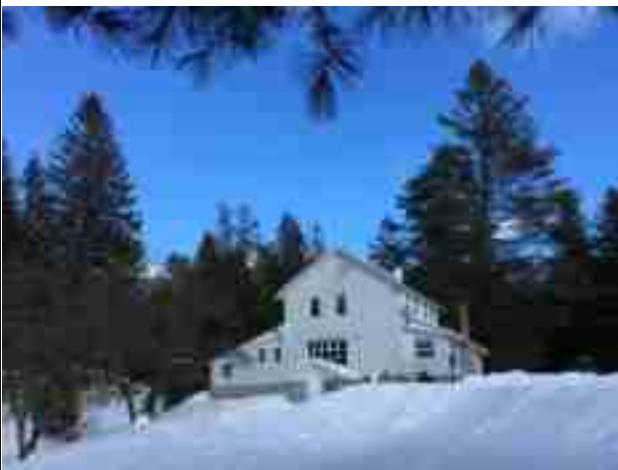
Lapin Farmhouse

Even the ADK had issues with snowfall this year in the East: While there was adequate snow cover on the trails that were open and groomed (the black diamond extensions were closed), We had no fresh snow during our stay until the very last night.