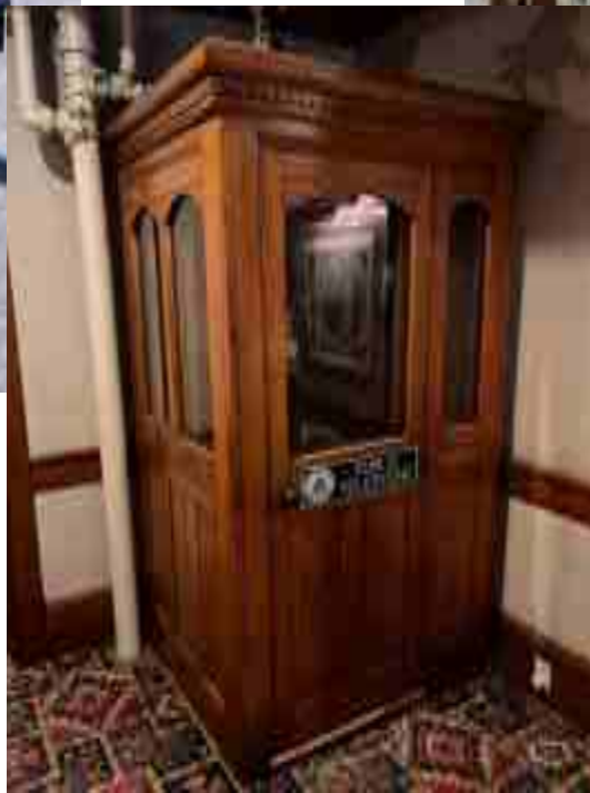
Phone booth at Eagle Mountain Lodge