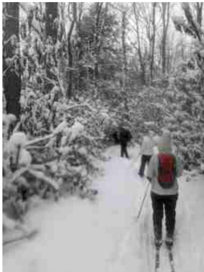
Toward Pase Point