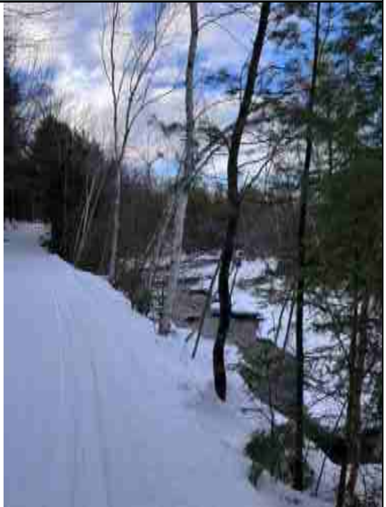
Ellis River Trail, Jackson

Saturday I went out at sunrise and skied