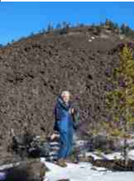
Ralph Bend Ski Trip Video