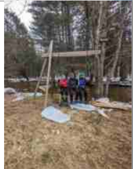
Althea, Doug and Marcie on the Giant Swing

There are basically two sets of trails at Lapland Lake, with a very large set of combinations and permutations using those two. One is flatter and referred to as the “Lake Side”. Very scenic, including a wide-open view from a lake edge. The other set is referred to as the “West side”, and has more intermediate and expert trails. By choosing one turn instead of another, one loop instead of another, we could cover much the same territory on a subsequent day but have it seem totally new. The trail system was well thought out by ol’ Olavi. A whimsical and fun feature was coming across a giant swing that served as a resting spot on one of the trails.