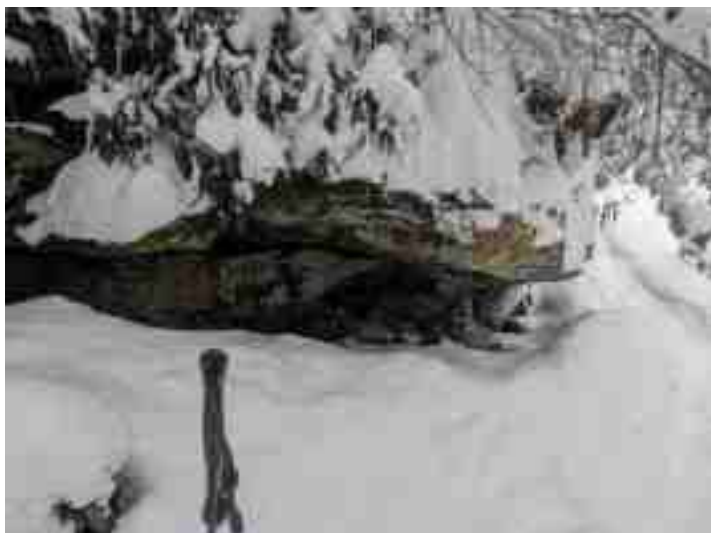
On the Elakala Trail near the Lodge on a snow shoe