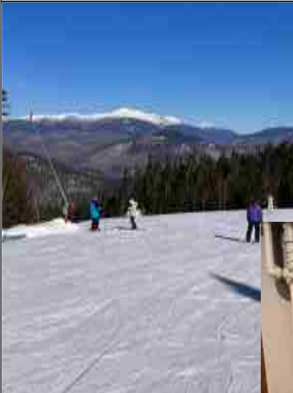
Mt. Washington from Attitash Ski Area