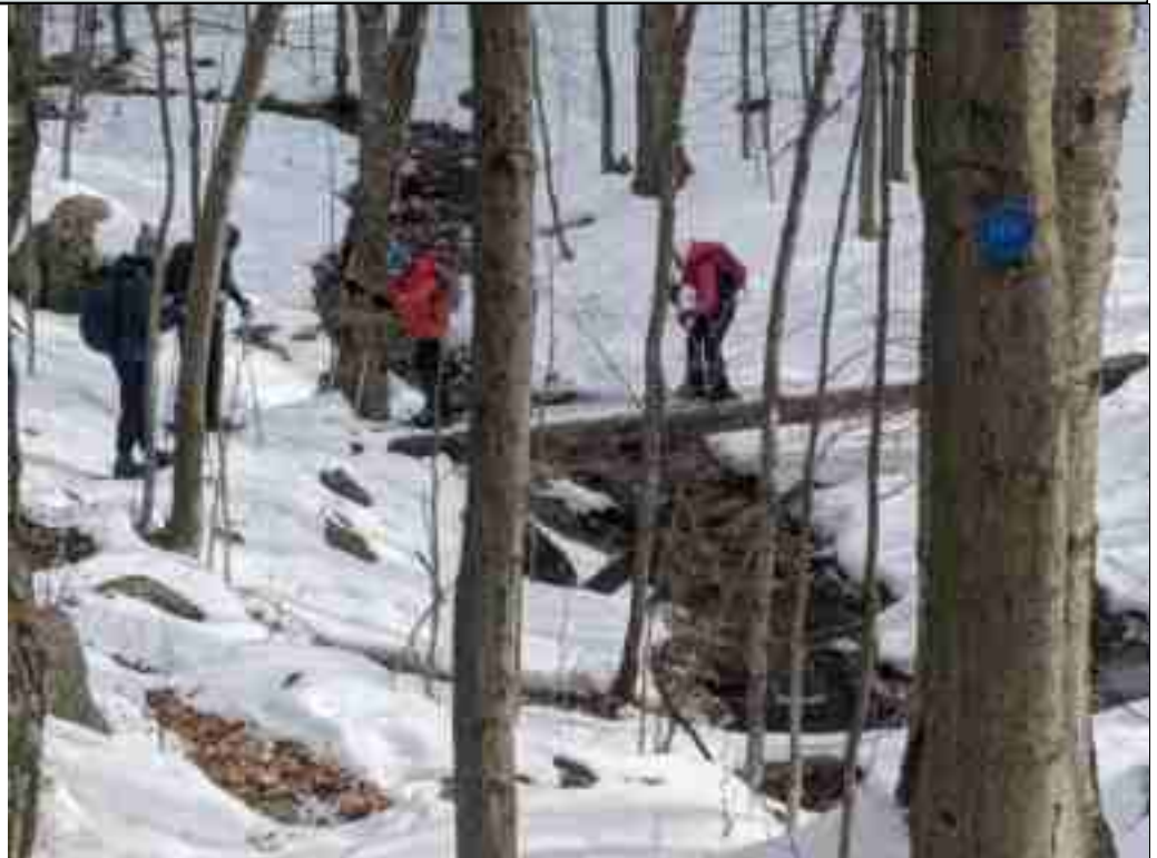
Althea and Joy cross the icy bridge as Brian and Doug look on

Lapland Lakes Nordic Resort rates highly as a go-to ski destination for these snow-deprived latter days of Mid-Atlantic skiing. It combines comfortable accommodations, affordable prices, and highly skiable groomed trails in a triple-threat that is hard to beat.