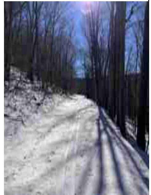
Three-Mile Trail on February 3