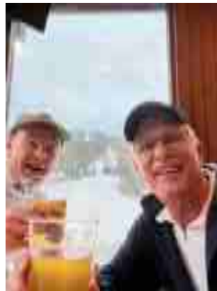
Apres Ski!