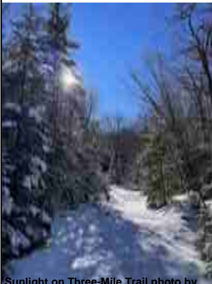
Sunlight on Three-Mile Trail