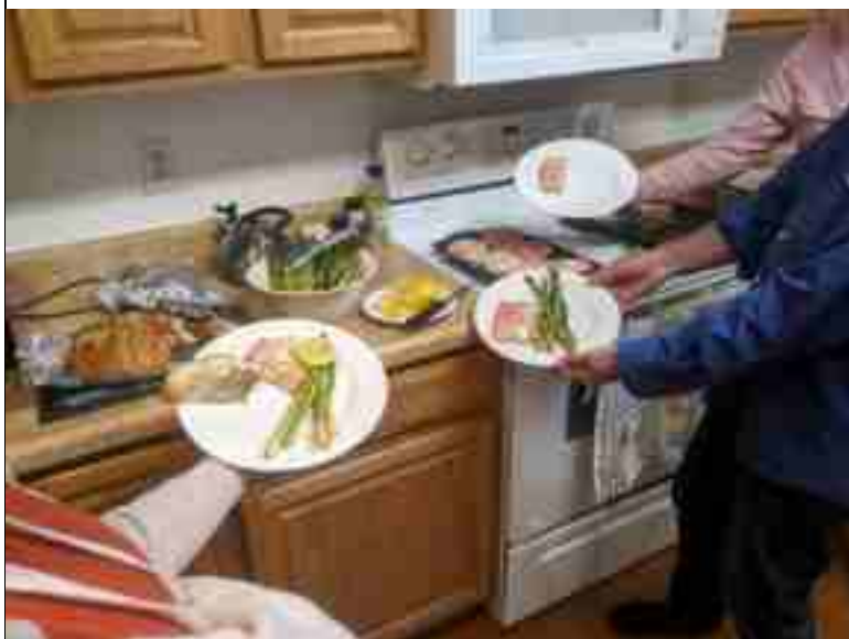
Slim pickens at the Deluxe Cabins

Two lovely dinners and interesting conversations made the excursion even more of a treat. A big thanks to Ralph Heimlich for cooking two yummy dinners and arranging such a fine trip.