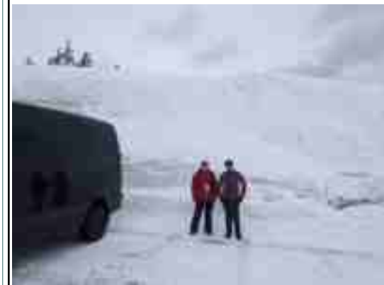
Snow at Mt. Bachelor Bela and Brent

Typically, in late February and early March, the 24-mile drive west from Bend to Mount Bachelor parking lot will begin with dry pavement (no ground snow) in Bend and increase to a snow base of 10-feet at Mt