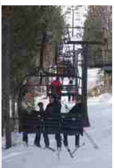
Steve, Jim & Alan on the lift at Black Mountain Ski Area. We had to purchase one-ride lift passes in order get to the great East Pasture trail network.

Saturday cold temperatures returned and we opted to return to the Jackson STC for a day on a different set of trails. The parking lot and center were far more crowded when we arrived, so we got our trail passes as soon as possible so we could get out and ski. This time we headed more directly north from Jackson village in the direction of Black Mountain. The chal-