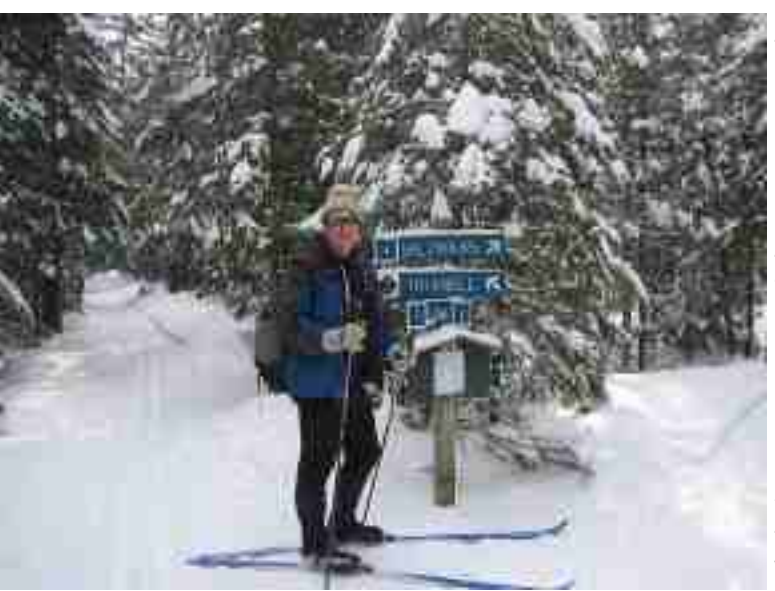
The trail combo 2-4-2 (Triangle-Salzbourg-Triangle) was recommended to us. The black diamond section of Triangle to the left was called the Bobsled Run. We wisely avoided it.

For our final day of skiing we chose to visit a ski venue that none of us had ever seen before. It lies in the town of Morin-