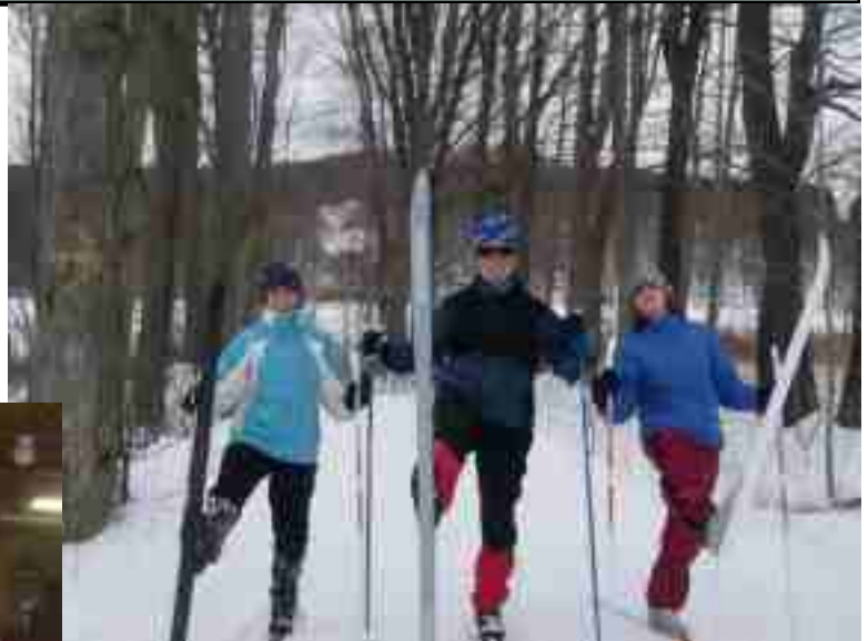
Ski Dancers (actually, you don't have to dance on skis, but it helps)

This President's Weekend, February 13 - 16, 2009, the woods and mountains around Laurel Highlands, PA, will once again rock all day with the sounds of happy skiers and all night with the sounds of dancing. Sponsored by PATC-STS and the Sierra Club, the Ski Dance has a long tradition of family fun. Come join us in Pennsylvania's Laurel Highlands as we cross country ski (downhill skiing available near by), sled, contra dance, make music, and have lots of fun outdoors and indoors in a beautiful rustic setting. Bring your talents and instruments to share.