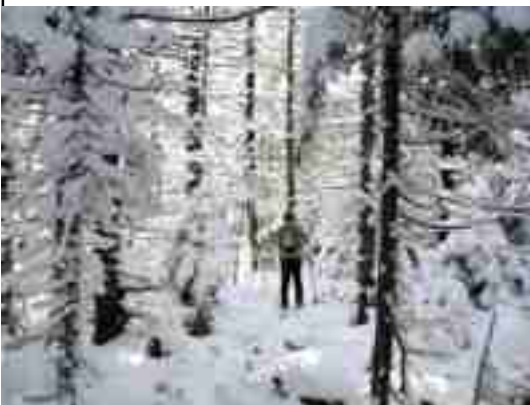
White Grass up in the trees

You can't strike out every season! White Grass Touring Center in Canaan Valley has had 55 inches of snow already (as of November 30), so you haven't got any excuse not to ski this year.