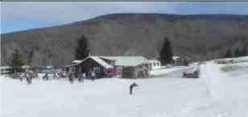
White Grass Café and Ski Touring Center