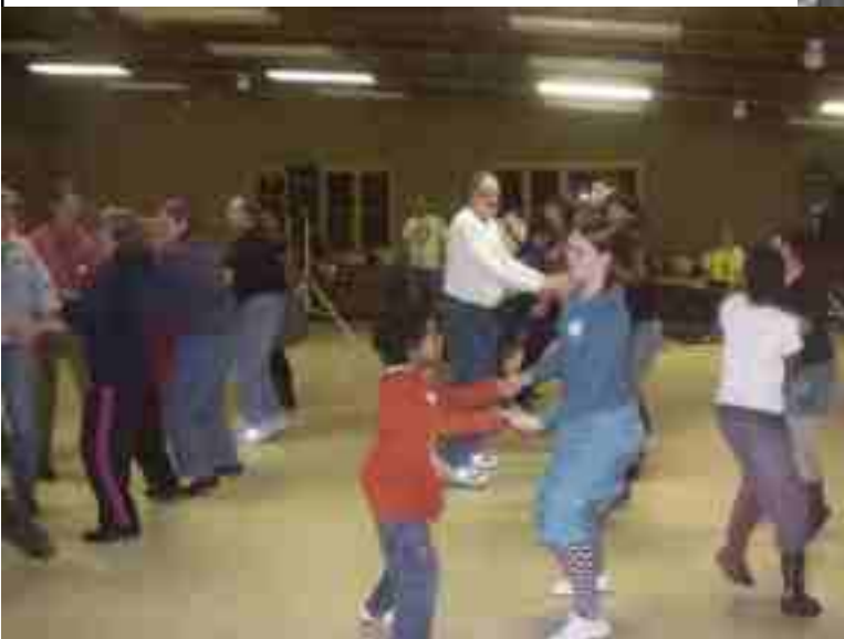
Dance Skiers (actually, you don't have to ski on the dance floor, but it helps)