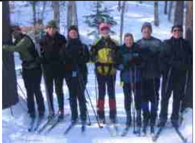
STS skiers at Bear Notch Ski Touring Center, Bartlett, NH January 2008

Over a half dozen people have signed up for this trip thus far. There is room for more. We have rented a beautiful new house in Bartlett, New Hampshire as our base of operations.