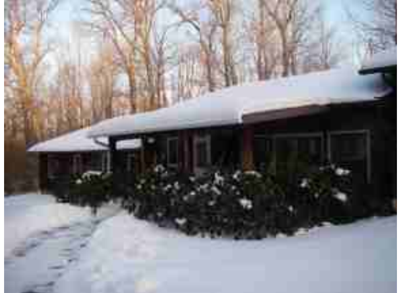
Accommodations, as if you'll have any time to sleep with the skiing and dancing