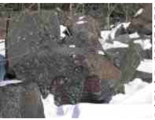
Garnet Hills garnets

In 1934, you could pay $2 and ride the train from Schenectady to North Creek. You were matched with a local family and ate and boarded with them. You paid them $.50 to get a car ride up the mountain, and spent all day skiing back down. Skiiers didn't come from New York City until they hit on the idea of putting fashion models in ski clothes and putting their pictures in the paper. Jim's uncle modeled in ski clothes and was shown on a huge banner in Abercrombie and Fitch's store in the city. Jim gave us each a copy of the 1930's era ski trail map, which featured some of the same trails we were skiing this day.