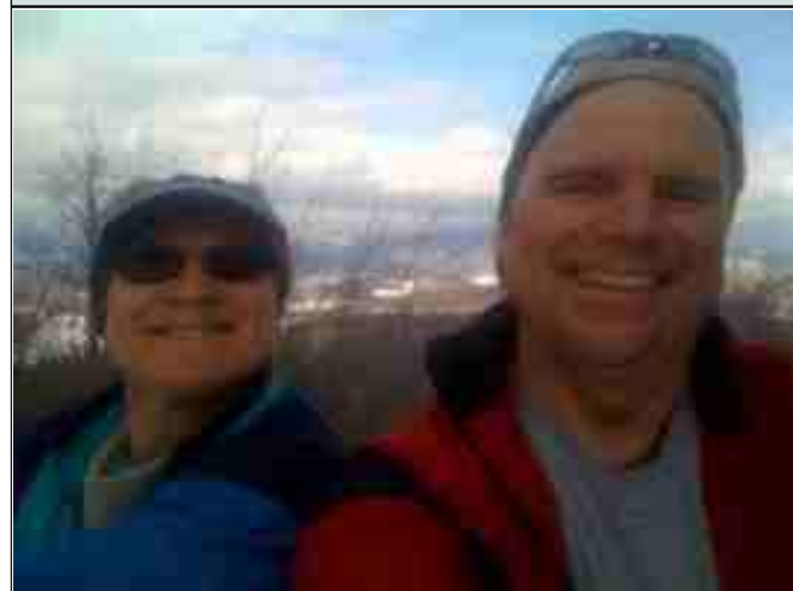
Still happy after having skied up Mount Antone in Merck Forest