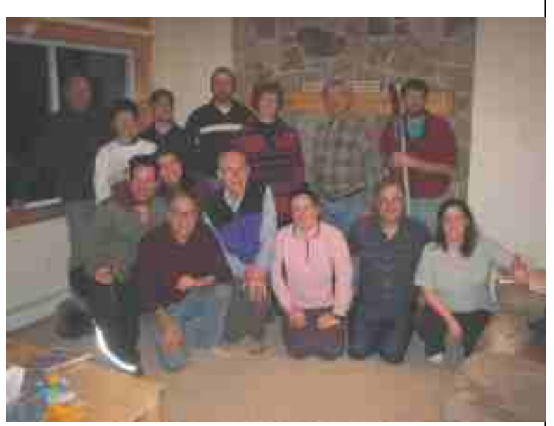
Most of the group on the final night in the rental house at Bartlett

We had a great rental house in Bartlett this year that was less than a year old. Two thirds of our 16 skiers stayed there, with the remainder bunking at a nearby condominium apartment. All our evening meals and socializing took place at the big house, though the condo did give us access to a community hot tub and sauna for those who were interested.