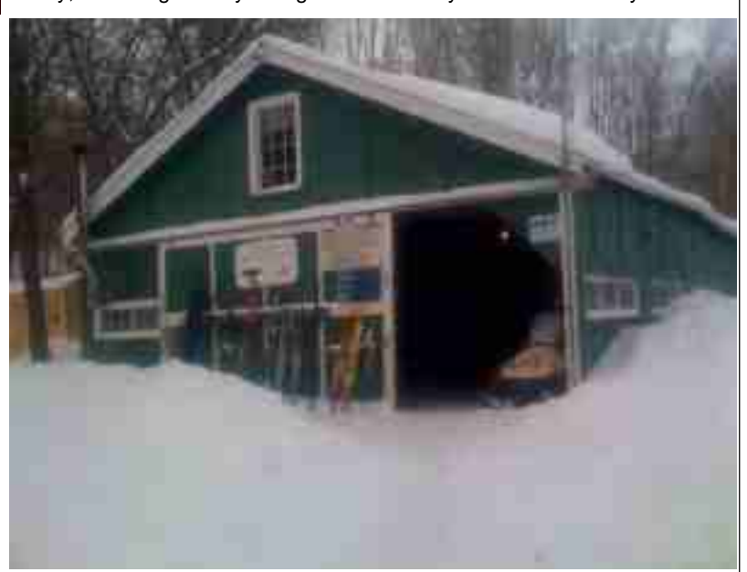
Wild Wings touring center

After a B&B at the comfortable Inn at Manchester, we set off back into the Green Mountains with snow falling. The ranger station northeast of Manchester was very helpful and is an excellent stop. Then on to Wild Wings Cross Country Center with it's one way, classic only grooming – as in "no skating allowed on the trails". We managed to ski something like ten of its twelve miles of very nice trail network, helped by fresh snow. Unfortunately, the straight away skiing reveals exactly how fast Bill really is – I