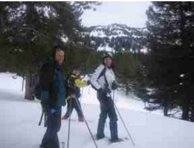
Deep snow in Yellowstone backcountry