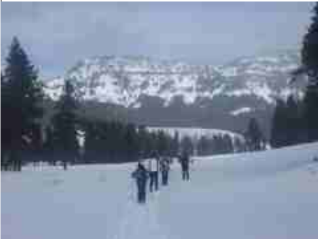
Starting toward Sky Rim in the distance

But despite the excellent conditions at Rendezvous, most of us had traveled west more for backcountry skiing rather than the groomed conditions of a ski touring center. For most of our days in West Yellowstone, we enjoyed a wide range of ungroomed ski trails in the western sector of the park and in the nearby forest. The Free Heel and Wheel sports shop near our motel offered ski equipment and snow shoe rental. STSers skied the Riverside trail along the Madison River and launched into the park's backcountry from a number of trailheads along Highway 191, such as the Specimen Creek, Black Butte, and Fawn Pass trails.