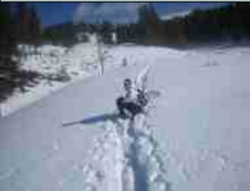
Mollie post-holing

group along very faint old ski tracks in the snow. When those ended, he switched to following elk tracks and occasional blazes on the trees. The higher we ascended, the more challenging the Sky Rim escarpment appeared to us. In woods near the base of the ridge, we stopped for lunch and to switch over to snow shoes. We were very careful to balance on the skis when transitioning to the new foot ware. Our skis were left stuck into the deep snow like sentinels to await our return.