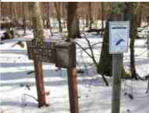
Herrington Manor Trails

On Sunday, snow conditions remained good despite moderating temperatures, and we skied the well-marked color-coded trails at Herrington Manor State Park nearby. We even came across a hot-blooded skier skiing topless on the trails! Late in the day, we also checked out Swallow Falls State Park and found conditions excellent there as well.