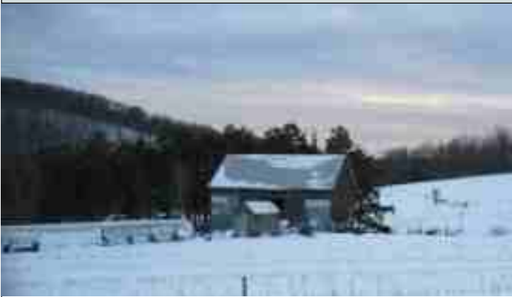
Backbone Farm