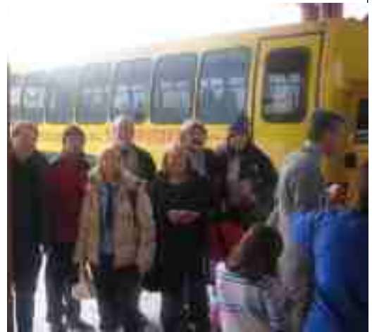
Getting there