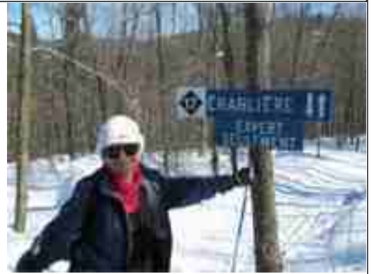
What does this say in French?

from Burlington, VT. Van drivers will be rebated part of the trip cost. Six full days of skiing in Quebec with the overlay of an almost-European culture! Note: Valid U.S. passport required for this trip.