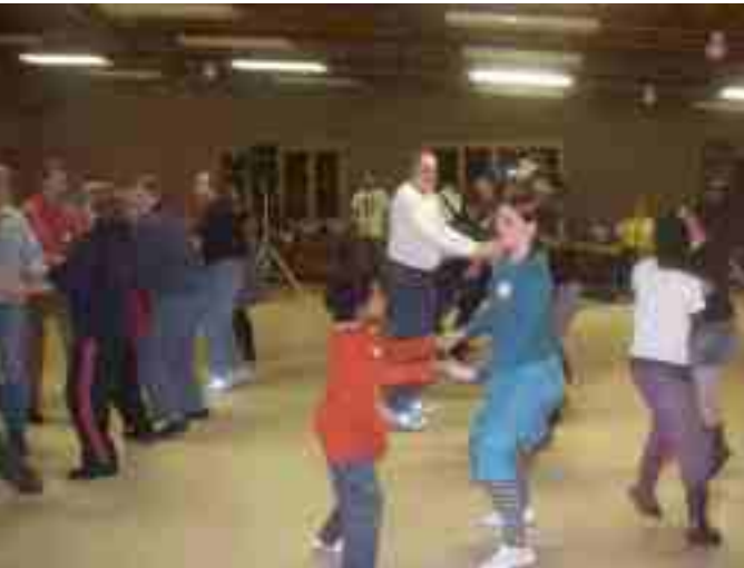
Ski Dance Weekend