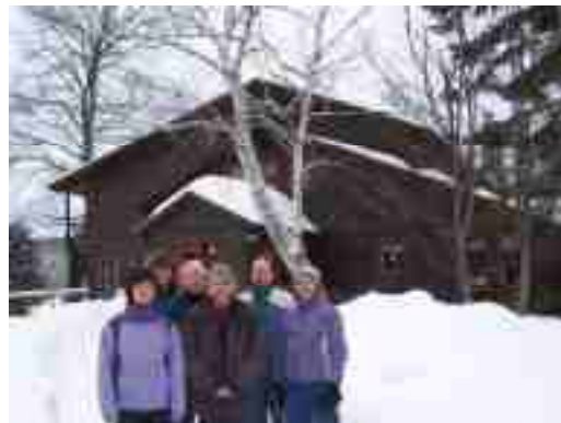
Garnet Hill Lodge, Adirondacks