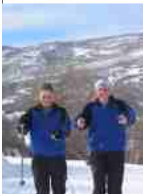
Skiing at Soldier's Hollow