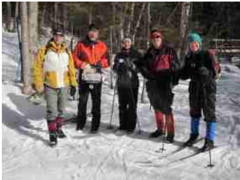
Stand-up Lunch at Botheration Creek Bridge