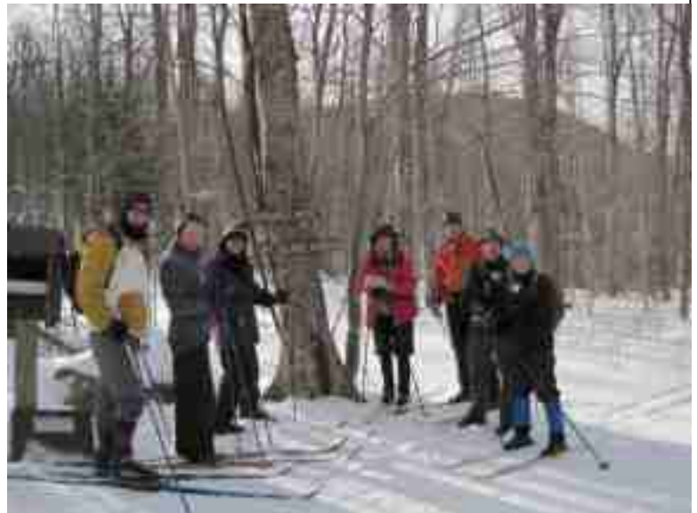
On the way to Botheration Pond

After a leisurely breakfast the next morning at our B&B, we arrived to check in at GH at 10:30 AM, to a bright, crisp 12 degree morning, and the announcement from front desk staff that all of the rest of our group had already checked in! So, the irony reached a crescendo—