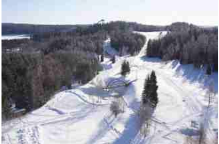
Tehvandi Sports Center

also about 12 km (7.4 miles) of track (classic and free style) from Pühajärve Lake Spa Hotel to the Kääriku ski center of which the last 3km (1.8 miles) from Sihva to Kääriku is lighted at night. The shorter 2 km (1.2 miles), 5 km (3.1 miles) and 15 km (9.3 miles) groomed tracks are also located in that resort. Another XC ski resort in the area is the Tehvandi Sport Center with several trails from 2 km to 10 km including the 3.75 km (2.3 miles) classical and 3.75 km free style track. Both of these tracks are lighted and open daily until 9 pm. There are also 2 km (1.4 miles) and 2.5 km (1.6 miles) of lighted race tracks and a 10 km (6.2 miles) hiking trail available for backcountry skiers.