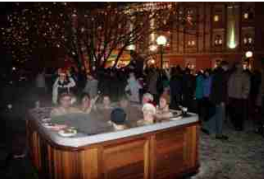
Après Ski in Estonia

The best downhill slopes (in otherwise flat Estonian landscape) are also located in the Otepää / Kääriku region. The longest run in Otepää (450 m/1,476 ft.) is called Vaike-Munamägi and another downhill resort near Otepää is Ansomagi with 5 lighted smaller slopes. During every winter season a number of Nordic ski events, including the World Cup Cross Country stages are held in the Otepää / Kääriku region. Otepää is one of the locations in Estonia where you can always find snow during the winter season since Otepää is located up-country and far from the sea. The last two winters have been generous with abundant snow in Otepää and in Estonia. If you are tired after a long day and night skiing, there are plenty of opportunities to relax in and around Otepää. You could visit a ski museum, the Sangaste 19-th century castle, Estonian Flag museum or just relax at the Pühajärve SPA or other nearby spas with saunas, hot tubs, and swimming pools and other amenities. At night, Otepää area offers several restaurants, pubs, cafeterias and nightclubs with live music on weekends.