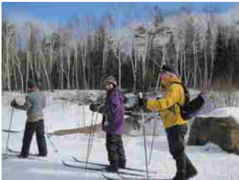
Skiers at Garnet Hill, Adirondacks