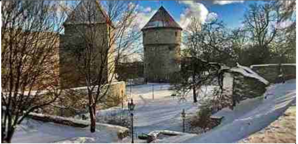
Old town Tallin in the Winter

If you asked an ordinary person on a street of Washington DC, New York or Boston a question about skiing, it's pretty safe to say that the person would assume that the question relates to downhill or Alpine skiing. However, if you would ask the same question on a street of the capital city of Tallinn or any other city in Estonia, that person would, with great certainty, assume that the question relates to cross-country skiing. This is because XC skiing is traditionally the most popular winter sport in Estonia; it is also a part of the Estonian culture in the winter.