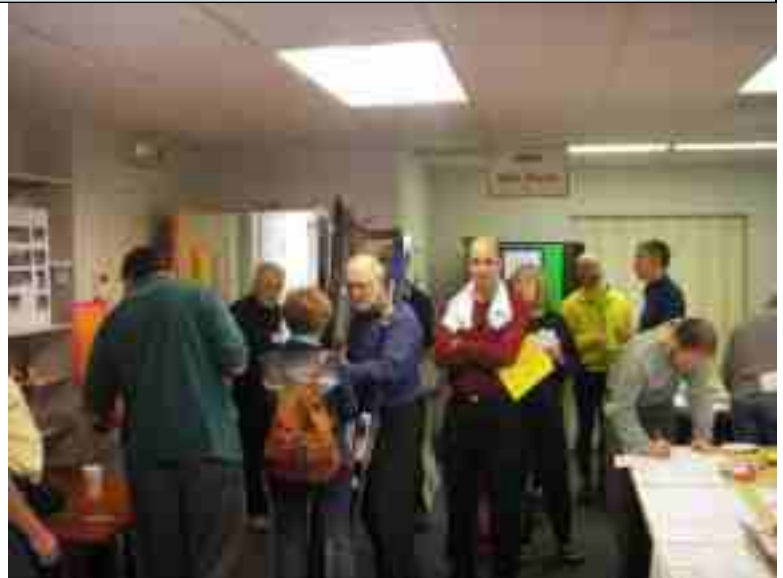
Lots of folks will be at the Ski Fair

By Bike: Yes, many of our members enjoy other forms of self-propelled transportation, and reaching PATC headquarters couldn't be easier. Take the Washington & Old Dominion Trail to Vienna. Where the trail crosses Park Street, turn north and ride roughly a block and a half until you see the headquarters on your right at 118 Park Street. Lock up, and come on inside; helmet hair and Lycra are welcome!