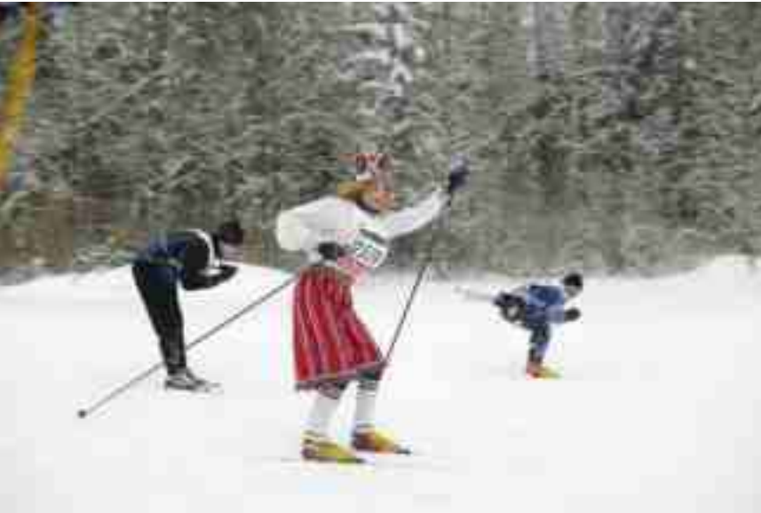
A show at the Tartu Ski Marathon

When the winter season starts and snow covers most of the country (which sometimes happens in November), you can see the XC skiers everywhere - at the ski resorts, city suburbs, parks and rural areas. Usually, a ski season in Estonia starts in December and lasts until the end of March. However, some XC ski resorts make snow and the ski season may be extended well into April. In Estonia XC skiing is a national sport and truly for everyone, men, woman and children of all ages young and old. In a grade school, XC skiing is part of a physical education class curriculum during the winter months. During the winter season many XC ski competitions are held throughout the country.