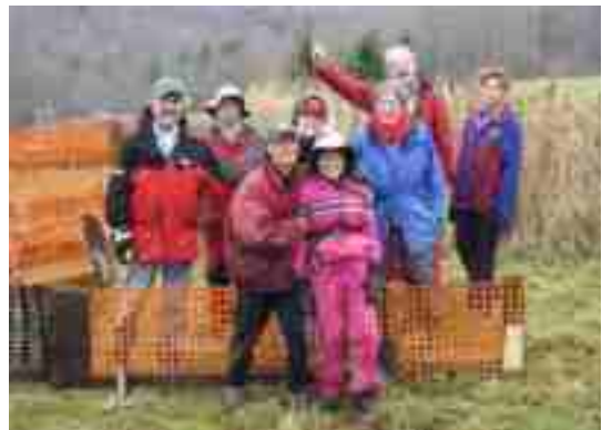
White Grass Work Trip, 2008