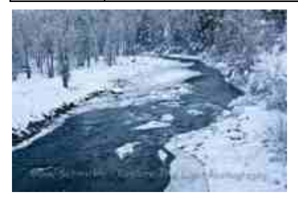
Pagosa Spring, CO