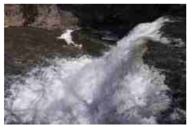
Blackwater Falls State Park, WV