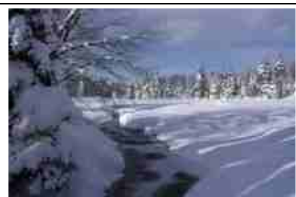
Tug Hill, NY