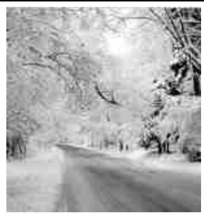
Laurel Highlands, PA