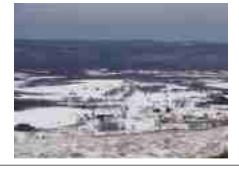
White Grass, WV