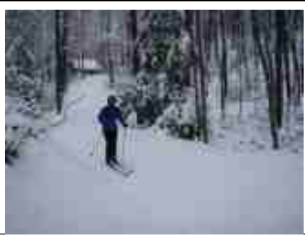
Crystal Lakes, PA