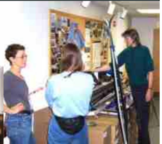
Swap or sell ski gear