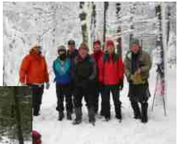
Top of Whitegrass

Or you can ski at one of our local haunts in Caanan Valley