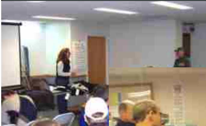
Hear a talk by an expert

Don't forget to bring and share healthy snacks to the Ski Fair. See you there!