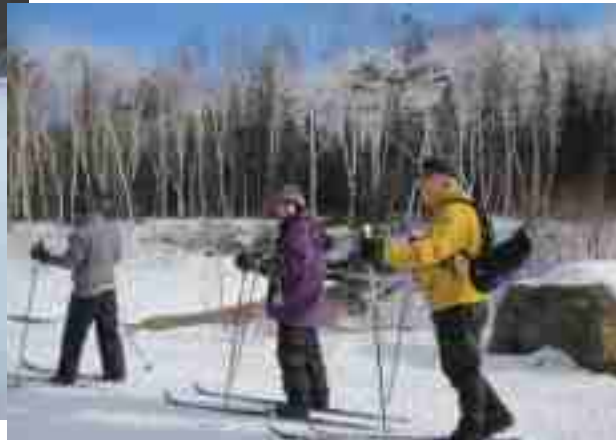
Skiers at Garnet Hill, Adirondacks

You can GIVE BACK to the cross-country ski community by helping prepare and repair X-C trails at Laurel Mountain or Whitegrass