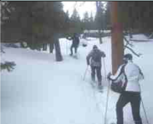
Skiers at Yellowstone National Park

We have expedition trips to far away places where there is SNOW if you GO!