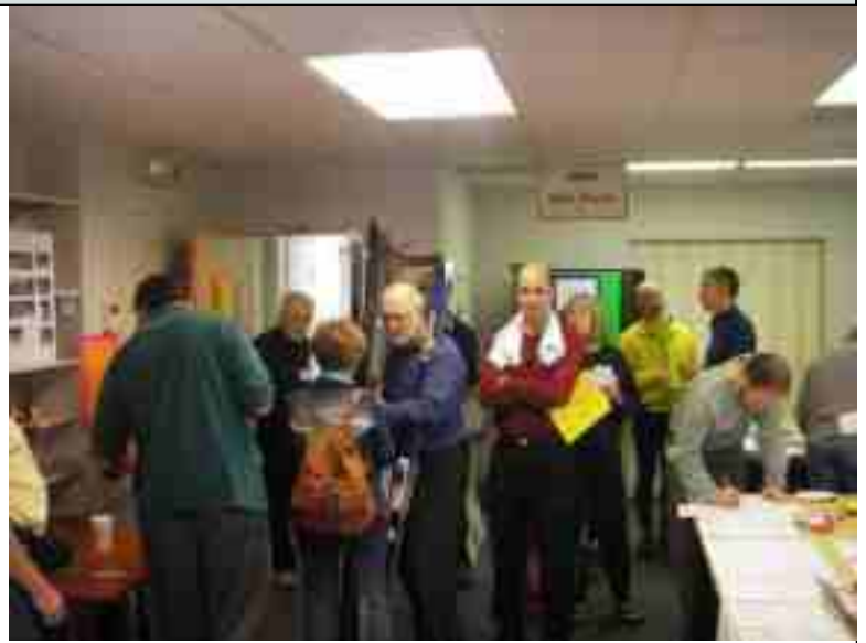
Lots of folks will be at the Ski Fair

By Bike: Yes, many of our members enjoy other forms of self-propelled transportation, and reaching PATC headquarters couldn't be easier. Take the Washington & Old Dominion Trail to Vienna. Where the trail crosses Park Street, turn north and ride roughly a block and a half until you see the headquarters on your right at 118 Park Street. Lock up, and come on inside; helmet hair and Lycra are welcome!