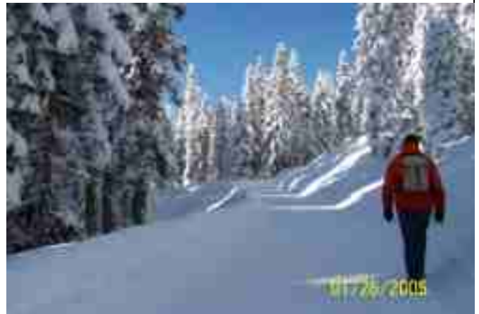
Trails above Kandersteg

Here's a view of the kind of groomed trails you can find there.