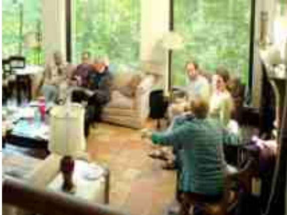
Après Ski Party