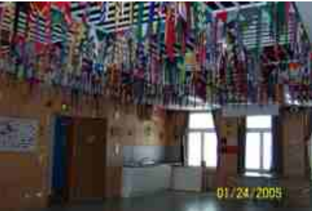
International Scout Centre

Kandersteg —Of course, my favorite spot in Switzerland is Kandersteg , in the Bernese Oberland near the border with Italy at the Gemmi Pass. There is flat-country skiing on the valley floor, lifts to several levels of downhill and Nordic runs, and a variety of other activities from snowshoeing to sled runs to “winter walking”. You are on a major passenger rail line that speeds you to Bern, Spiez and the Reichenberg Falls. And the village is classic Swiss, with a nice selection of hotels and guest houses.