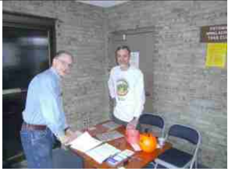
Renew your PATC-STS Membership

By Bike: Yes, many of our members enjoy other forms of self-propelled transportation, and reaching PATC headquarters couldn't be easier. Take the Washington & Old Dominion Trail to Vienna. Where the trail crosses Park Street, turn north and ride roughly a block and a half until you see the headquarters on your right at 118 Park Street. Lock up, and come on inside; helmet hair and Lycra are welcome!