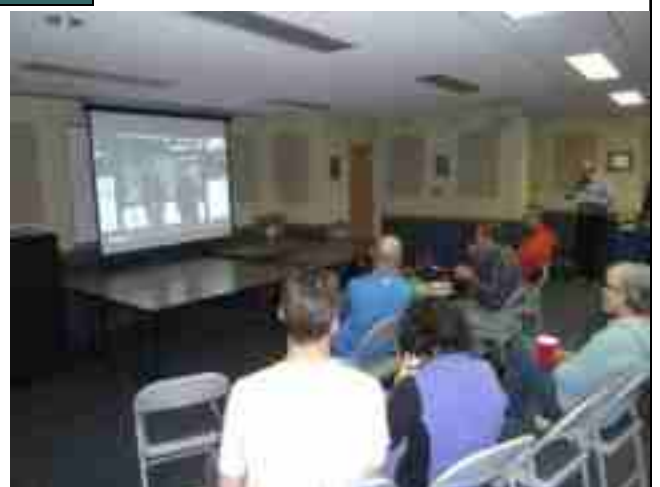
Learn about skiing (Continued on page 4)

By Car: Once you find the intersection of