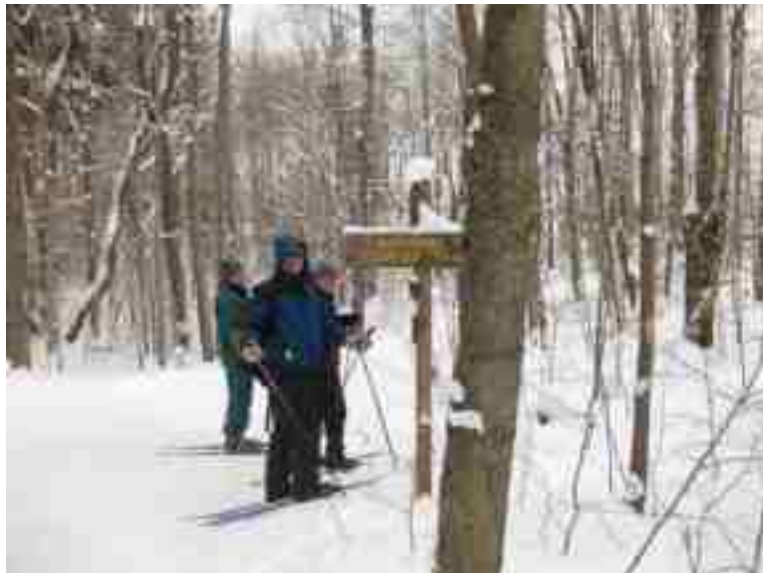
Tug Hill, New York, 2010