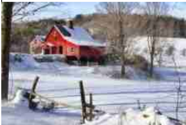
Glynn House Inn, Ashland, NH

https://secure2.convio.net/rtt/site/Ecommerce/315461964?FOLDER=1030&store_id=1141