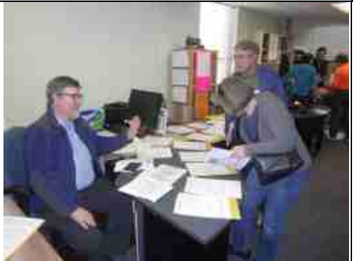
Sign up for ski trips

Join the Potomac Appalachian Trail Club's Ski Touring Section as we kick off the coming season with our annual Ski Fair. Whether you're looking for basic information about cross country skiing or gear, want to know more about local destinations, or are interested in joining one of our regional or out-of-area trips, you'll find it on Saturday, November 1, 12:30-4:30 at the PATC offices, 118 Park Street in Vienna, VA (directions below).