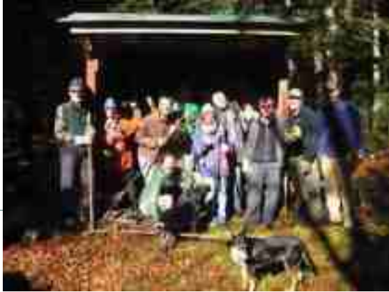
White Grass Work Trip, 2013