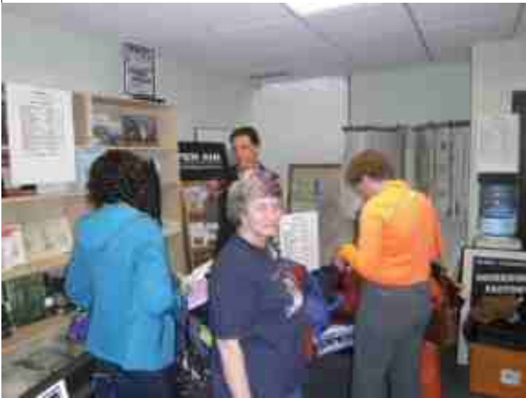
Buy OPEN AIR clothing