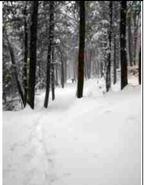
Jonas Day2 at New Germany SP