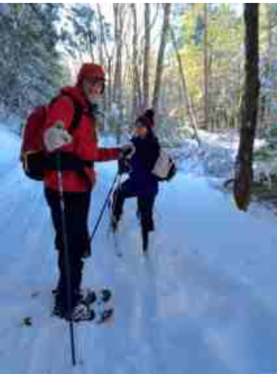
Breaking the Cabin Loop

I set out on my snowshoes, intending to stomp the whole Cabin Loop (red). By the time I reached the junction with the Blue Trail, I decided to descend to the Turnpike (green) along the creek and head back toward parking lot #5. A family of other cabineers were sledding from the turnaround at the end of the cabin road, and I used their return route, smashing it down a bit more in the process. After lunch, Sue, Edna and I set out on snow shoes to finish the Cabin Loop and made it all the way around by the end of the day.