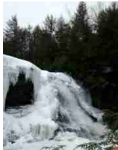
Muddy Creek Falls