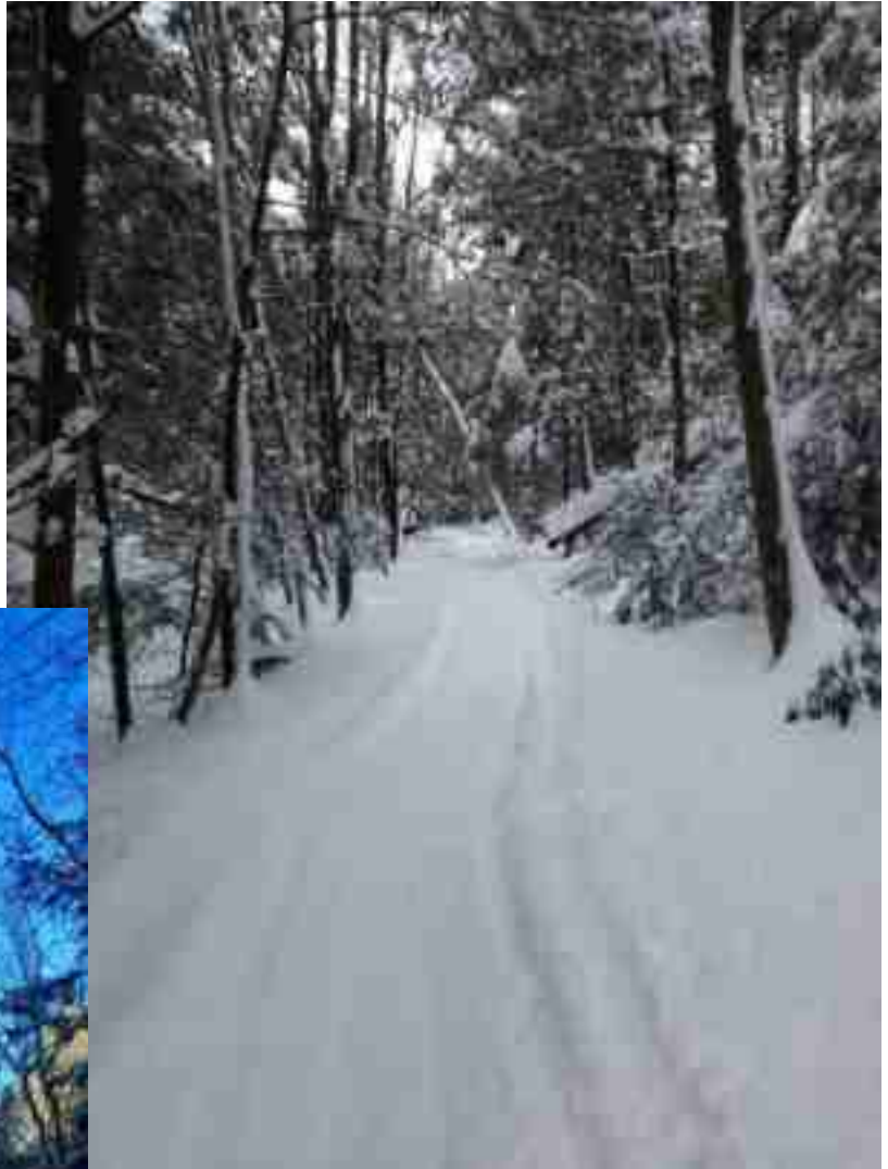
Sno-mobile groomed Turnpike trail

Editor's note: Ralph Heimlich reliably informs me that the larger Cabin #11 (which sleeps 8 or 9) has been reserved for January 2017 for the rematch. Stay tuned if you'd like to try New Germany's snows.