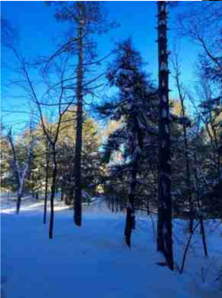
Blue sky Monday