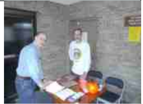
Renew your PATC-STS Membership

By Bike: Yes, many of our members enjoy other forms of self-propelled transportation, and reaching PATC headquarters couldn't be easier. Take the Washington & Old Dominion Trail to Vienna. Where the trail crosses Park Street, turn north and ride roughly a block and a half until you see the headquarters on your right at 118 Park Street. Lock up, and come on inside; helmet hair and Lycra are welcome!