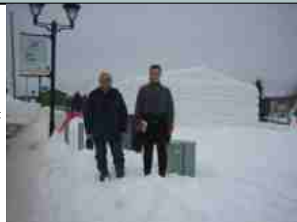
HIVER NORD snow sculpture in a Laurentians town, 2005

The STS ski group will be renting chalets in the Laurentians, most likely in the Chantclair Resort in the town of Val-David. See https://chalets.ca/ On previous trips we have rented chalets here and been very pleased with the accommodations. Those who know me will not be surprised to learn that each chalet has its own sauna. Depending on the size of the ski group, we will likely rotate among the residences we rent in terms of where evening meals will take place and where we will fix our daily lunches to take onto the trails. Bon appétit!