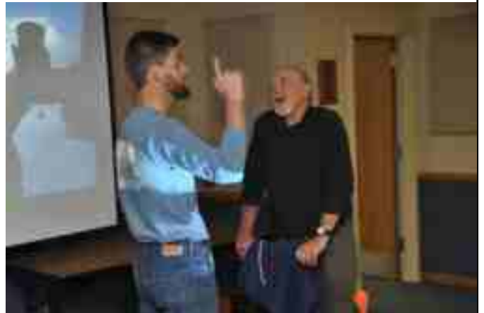
Learn about skiing

By Car: Once you find the intersection of Interstate 66 and Interstate 495 (alias the Washington Beltway), take the Nutley Street North (VA Rt. 243) exit just outside the Beltway. Go north just over 1 mile passing two traffic lights. When you get to the third light, turn right onto Route 123 (alias Maple