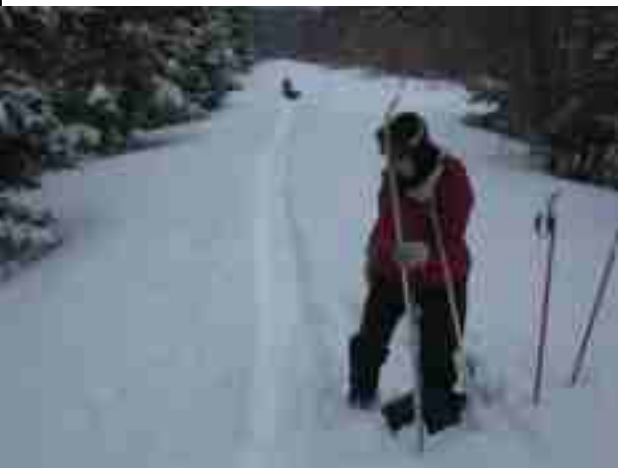
Deep snow on Le Petit Train du Nord rail trail, 2008