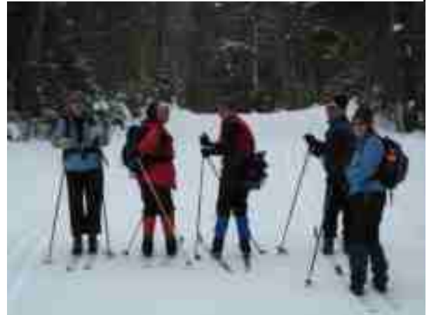
On the Laurentian ski trails, 2011

And, at the end of every day of winter sports in Quebec, there is always the après-ski socializing. Oh la la! It's not by chance that après-ski is a French expression. The grocery stores in Quebec are filled with a wide array of cheeses, breads, and other delicacies that really make it feel that you are in Europe.