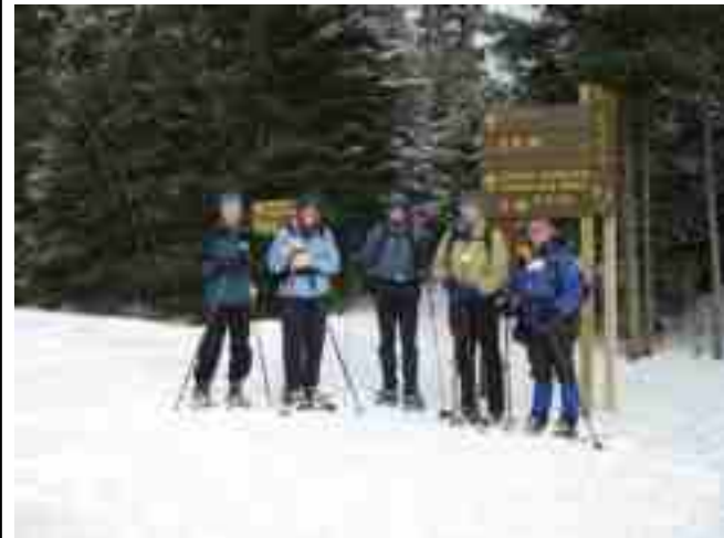
Snowshoeing at Mont Tremblant, 2011

There are other recreational opportunities on the snow. There's an excellent, large downhill skiing center at Mont Tremblant. See https://www.tremblant.ca/things-to-do/skiing . That allows some of us the opportunity to enjoy both Nordic and Alpine skiing on the trip. The Mont