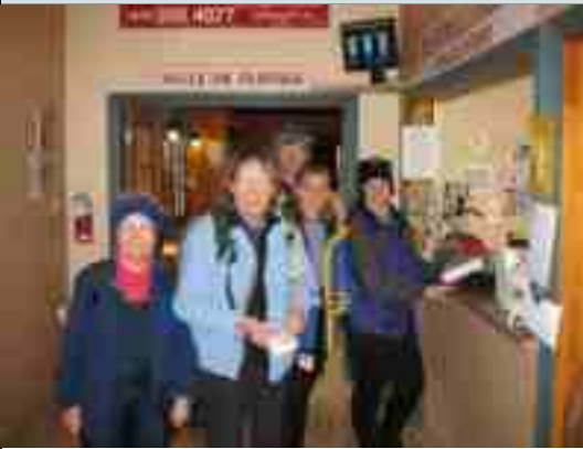
Getting ski tickets near the ski waxing room (sal de fartage), 2011

Most skiers on this trip will fly to Burlington, Vermont, rent vehicles there, and then drive north and across the Canadian border into