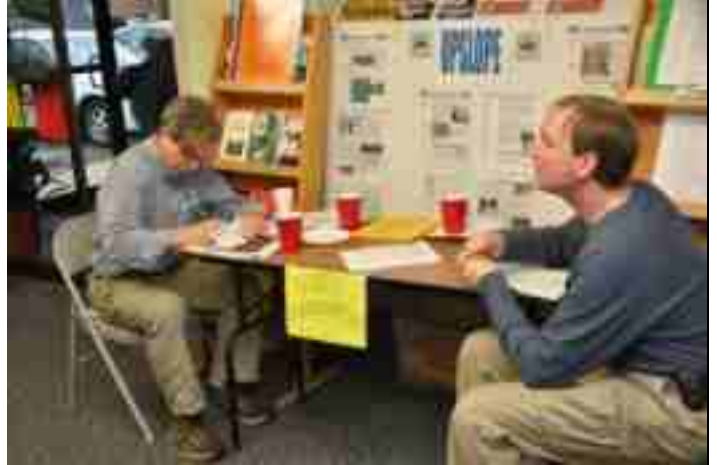
Sign up for trips

Join the Potomac Appalachian Trail Club's Ski Touring Section as we kick off the coming season with our annual Ski Fair. Whether you're looking for basic information about cross country skiing or gear, want to know more about local destinations, or are interested in joining one of our regional or out-of-area trips, you'll find it on Saturday, November 3, 12:30-4:30 at the PATC offices, 118 Park Street in Vienna, VA (directions below).