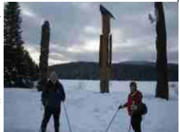
Totem poles at Mount Tremblant ski touring center, 2008