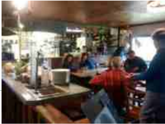
White Grass Work Trip, 2017