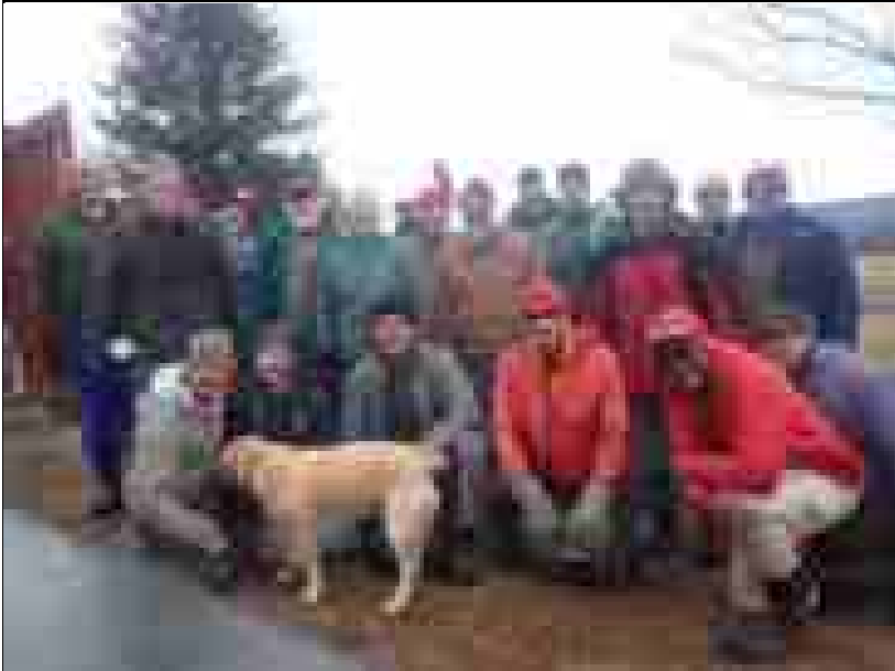
White Grass Work Trip 2019