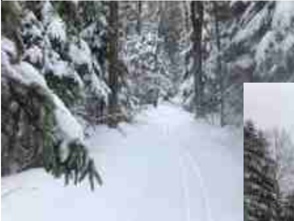
Canaan XC trail