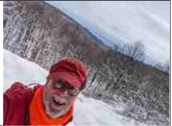
Selfie at Hog Rock