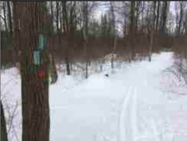
Nice snow at Catocтин Mountain Park

Just click the heels of your red ski boots together three times and repeat, “There’s no place like home. There’s no place like home...” That’s what I was telling myself at the beginning of last year’s ski season, as a combination of travel restrictions and my own Covid caution rendered trips to the Emerald City (Oregon) or the Enchanted Forest (the Adirondacks) out of the question for me. Those were the places I had been able to find snow of any consequence in recent years. But then, just like in the movie, it started snowing where I was, not in a poppy field, but here in the mid-Atlantic. At that point, I started looking up in the sky for flying monkeys.