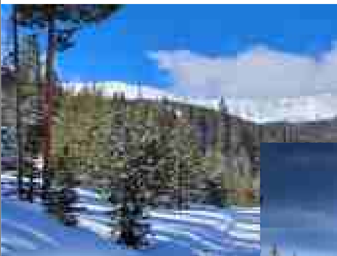
Dry Gulch