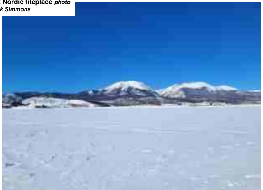
Lake Dillon and Summit County Peaks