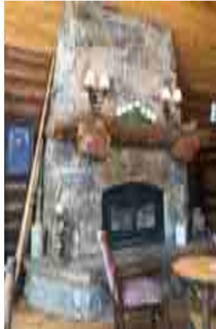
Breck Nordic fireplace