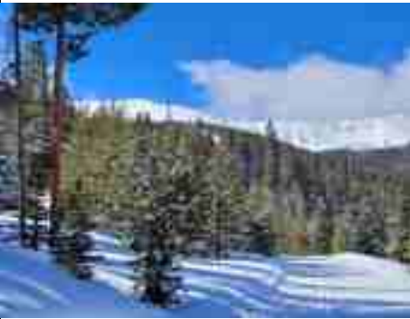
Trails in Summit County