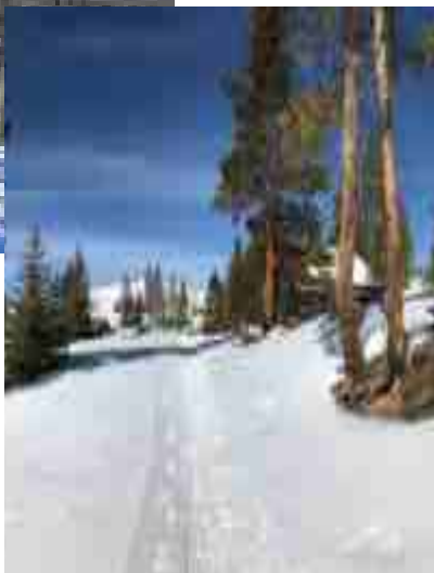
Dry Gulch Gold Mine