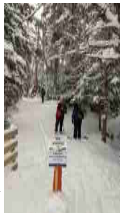
STS Skiers at Bretton Woods Nordic Center, NH 2020

Sun Peaks Nordic, British Columbia – affiliated with Sun Peaks Resort . Sun Peaks Nordic is a great, but little-known cross-country ski destination with 30-plus km of classic and skate-groomed trails. It features superb flowing terrain through meadows and forest, fantastic