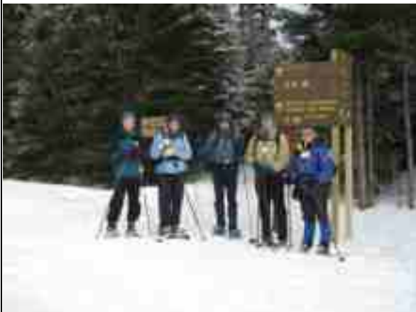
STS skiers at Mont-Tremblant 2010

Mont-Ste.-Anne Cross Country Ski Area, Quebec – affiliated with Mont-Ste.-Anne Resort . Mont-Sainte-Anne's trail system is vast and varied, mixing classic and a lot of skate-groomed trails. Mont-Ste.-Anne offers direct access from the alpine area onto 184 km of trails, making it one of the largest