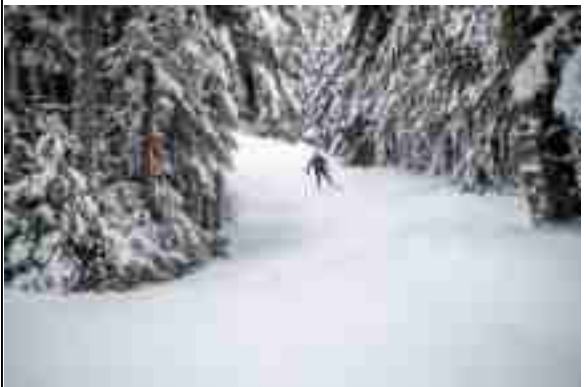
XC Skiing at Mt. Van Hovenberg in the ADK

Bretton Woods Nordic Center, New Hampshire – affiliated with Mt. Washington Resort . Bretton Woods Nordic Center is huge, home to a full-service day lodge and 95 km of groomed trails that wind across fields and through fir and spruce forest. It's marvelous for beginners and intermediates but offers challenge too, like the Black Diamond Tim Nash. Split into three distinct but linked trail networks, Bretton Woods is a beautiful cross-country skiing destination, dominated by the Presidential Range to the east and the majestic Mount Washington Hotel below. Pro tip: Ride a detachable quad up the alpine area and take blue or black trails to lower elevations. It also offers fat biking.