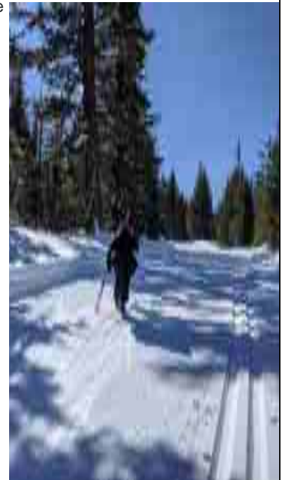
STS skier at Mt. Bachelor Nordic Center, Oregon 2020